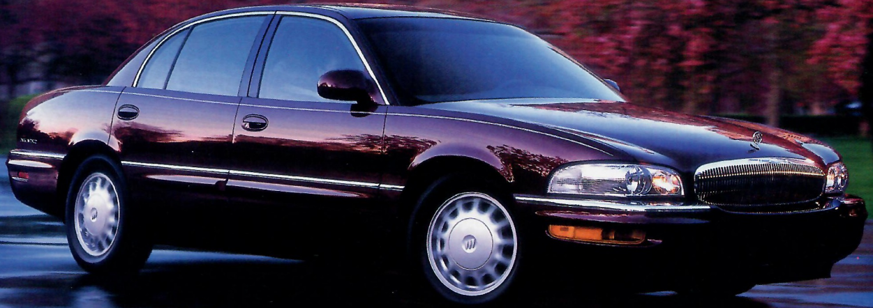
Park Avenue in Bordeaux Red Pearl, shown with optional equipment.