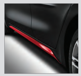
Side skirts -(Red. Black or Silver)