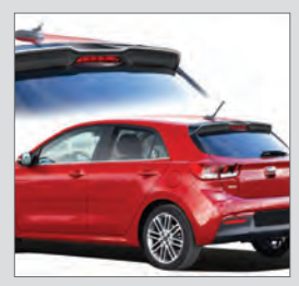
Rear hatch spoiler (Rio 5-door only)