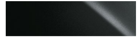
STARLIGHT BLACK MICA