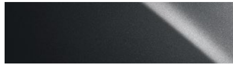
NEBULA GREY PEARL