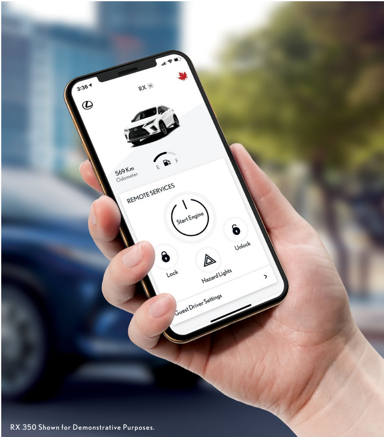
RX 350 Shown for Demonstrative Purposes.