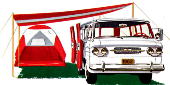
REGULAR GREENBRIER with a SHELTER UNIT and a POP-UP TENT