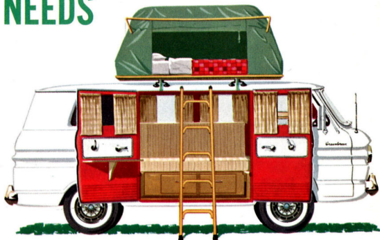
GREENBRIER equipped with a CAMPER UNIT and a TOP SLEEPER UNIT