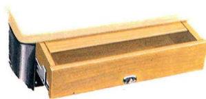
PART NO. 985105

A 15 inch by 35 inch drawer, 7 inches high that fits under the intermediate seat and equipped with a sliding top to reduce dust. Ideal for small parcels. Used only with intermediate seat.