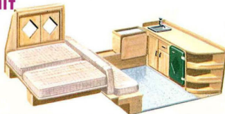
PART NO. 985654

Complete with double bed, drapes, sink and ice refrigerator. Installed or removed from the vehicle quickly. With the addition of a stove and cooking utensils, a complete home on wheels.