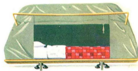
PART NO. 985102

SLEEPER UNIT Waterproof olive drab canvas with collapsible metal frame supports and plywood base. A raised height of 6 1/2 foot by 4 foot, 33 inches high with a two section ladder. Folds to neat streamlined appearance for traveling.