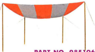
PART NO. 985106

SHELTER UNIT Made of 10.10 ounce army duck complete with four aluminum poles, four steel stakes and rope tighteners. Ideal as protective covering over camping equipment and provides a shaded area for relaxing.