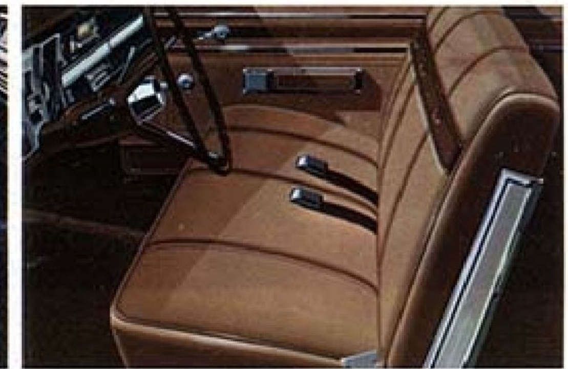
Cloth-and-vinyl interior. Standard in Monaco 4-door sedan.