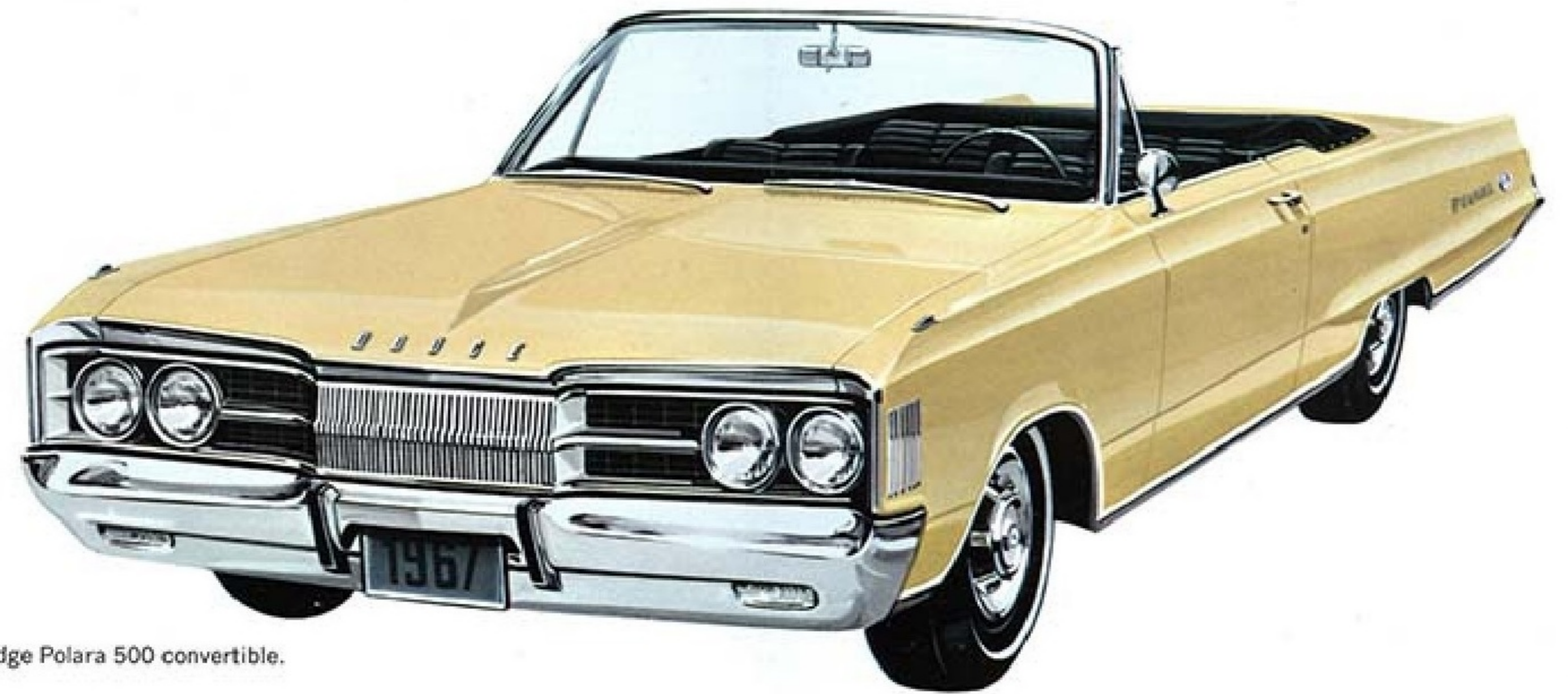
Dodge Polara 500 convertible.

*Special, buffed, silver-metallic paint is offered as an additional body color, at extra cost.