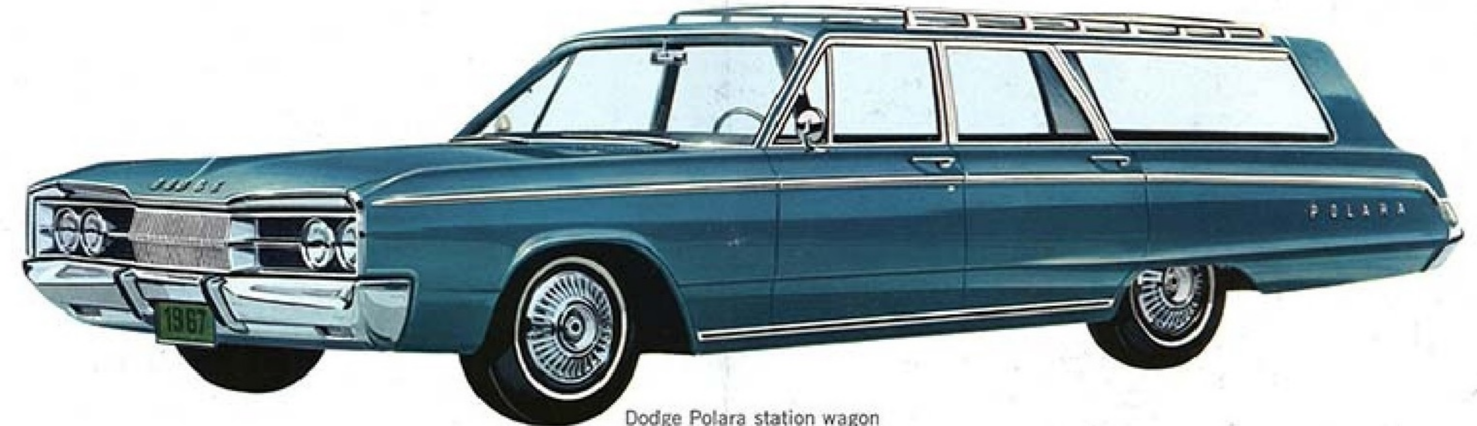
Dodge Polara station wagon (2-seat and 3-seat models).