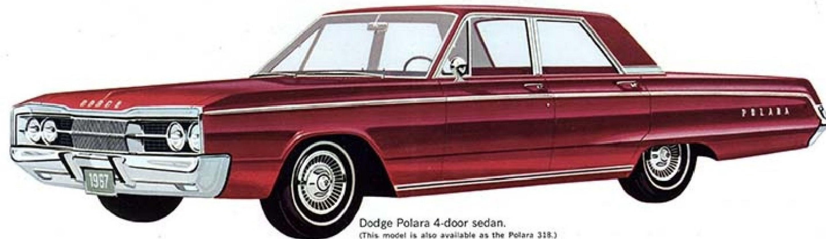
Dodge Polara 4-door sedan. (This model is also available as the Polara 318.)