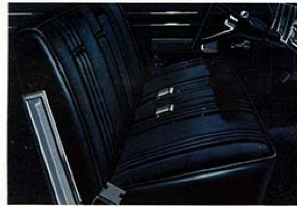
All-vinyl interiors, standard in Monaco wagons. Front bucket seats are optional, at extra cost.