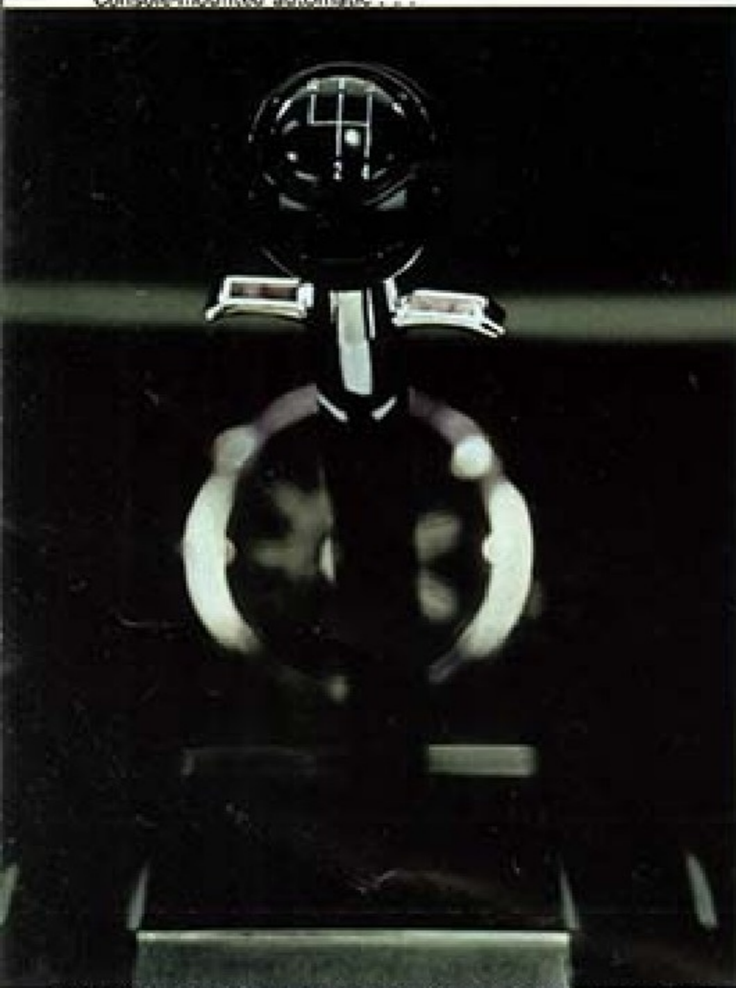
... fully synchronized 4-speed manual are Polara 500 extra-cost options.