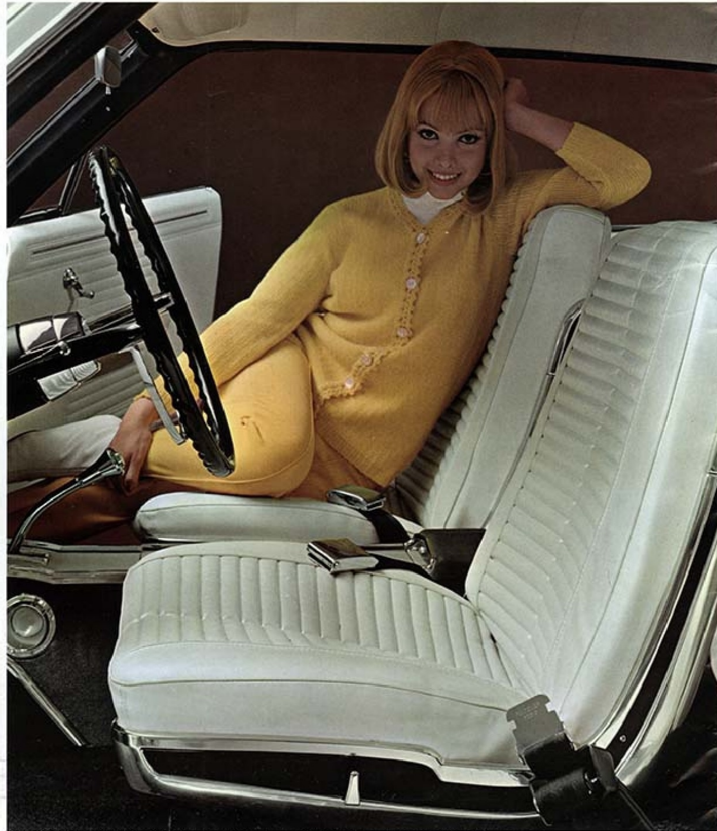
Polara 500 all-vinyl interior with optional (no extra cost) center console which replaces center cushion with pull-down armrest.