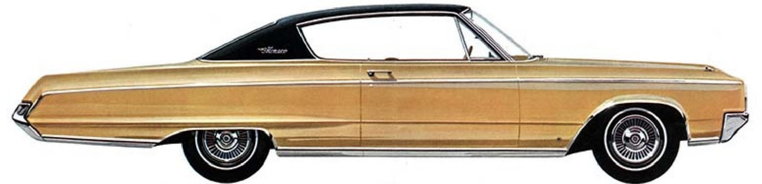
Dodge Monaco 2-door hardtop (front bench seat).