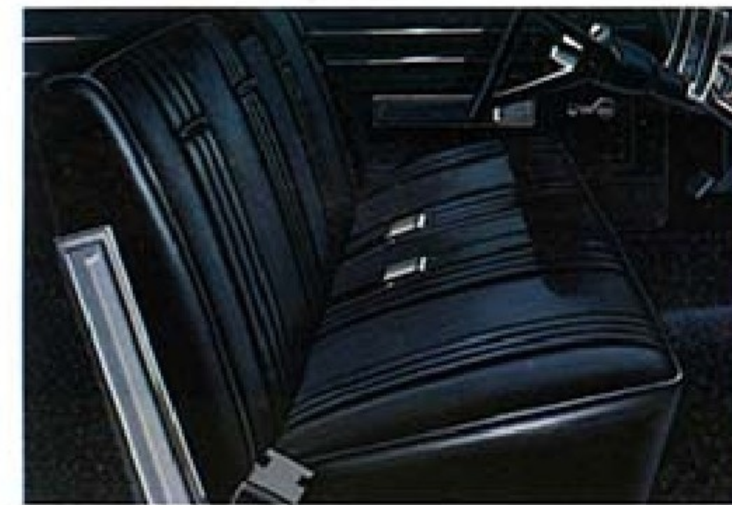
All-vinyl Monaco interior. Standard in Monaco 2-door and 4-door hardtops. Bucket seats (in front) are optional, at extra cost, in Monaco 4-door hardtops.

Standard safety equipment, included on all Monaco and Monaco 500 models, is shown on back cover of this catalog.