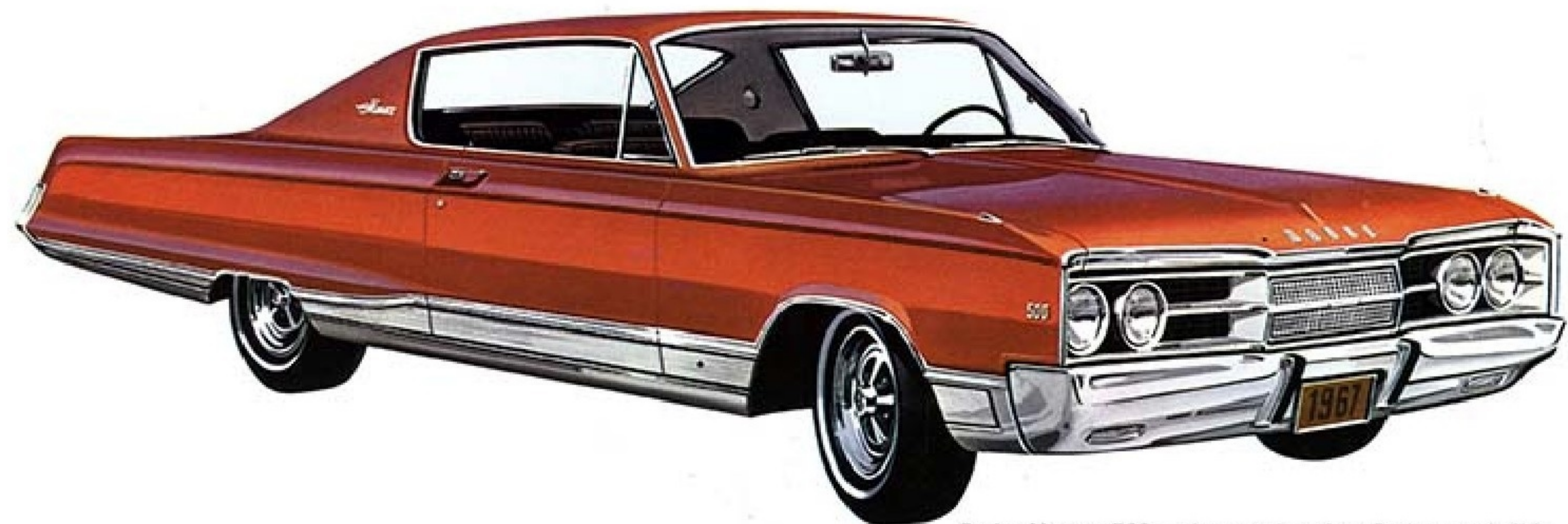
Dodge Monaco 500 — the most luxurious Dodge ever built!

Standard safety equipment, included on all Monaco and Monaco 500 models, is shown on back cover of this catalog.