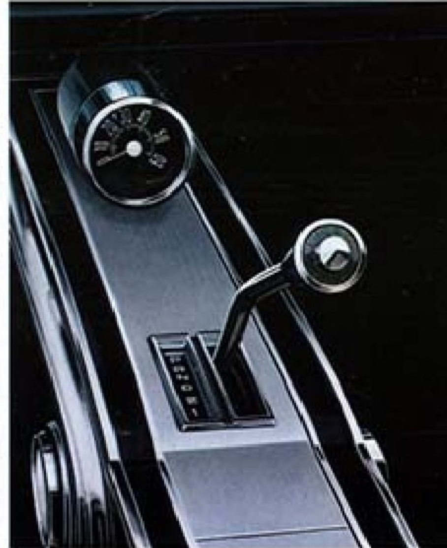
Automatic transmission is standard on Monaco 500.