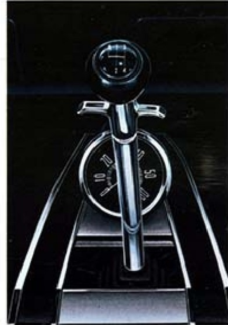
4-speed manual transmission and tachometer are optional, at extra cost.