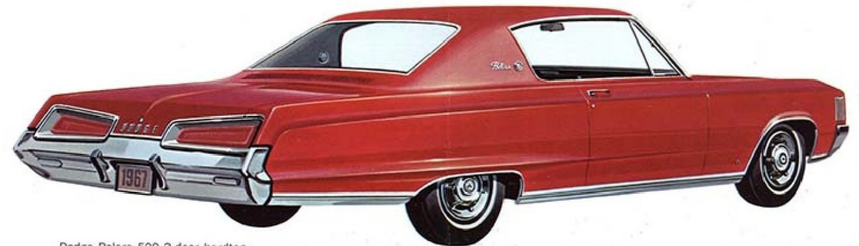
Dodge Polara 500 2-door hardtop.

Standard safety equipment, included on all Polara 500 models, is shown on back cover of this catalog.