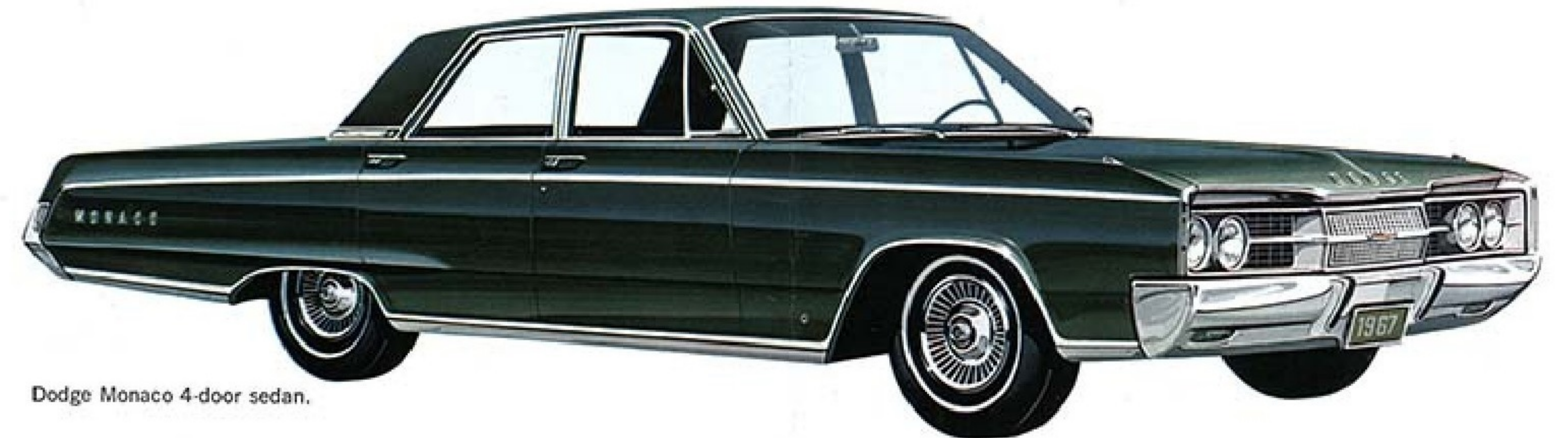
Dodge Monaco 4-door sedan.