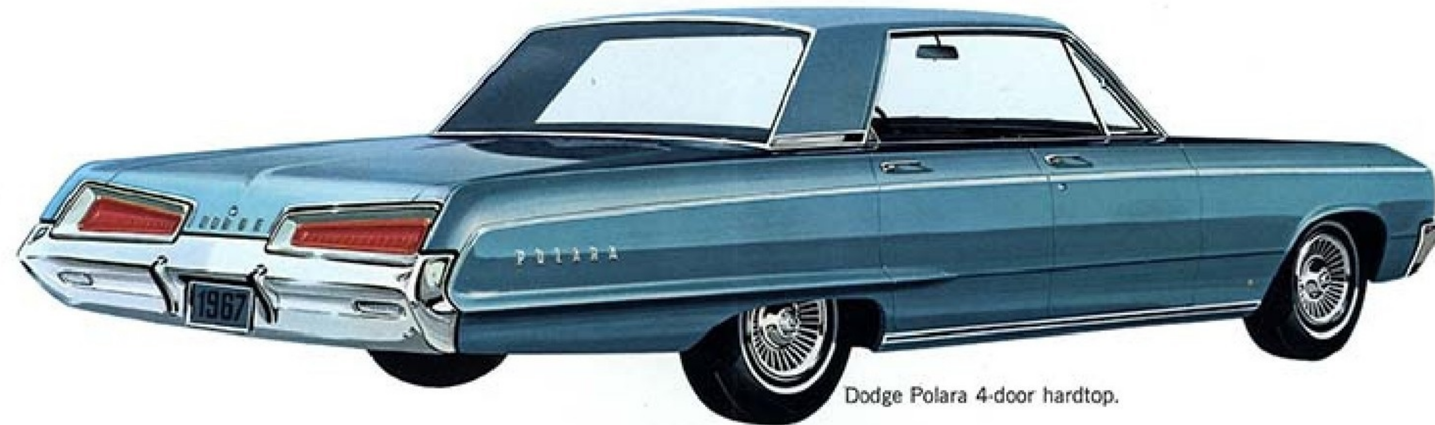
Dodge Polara 4-door hardtop.