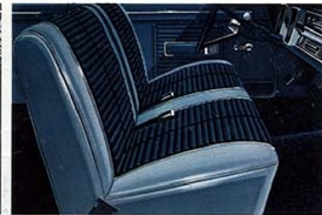
All-vinyl interiors, standard in Polara wagons.