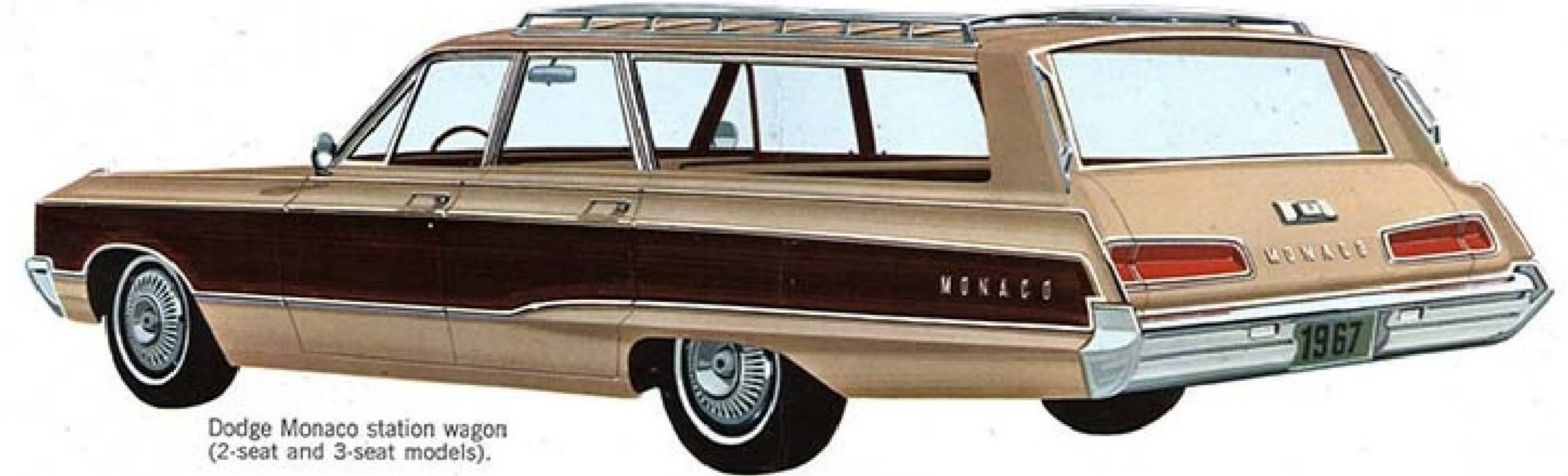
Dodge Monaco station wagon (2-seat and 3-seat models).