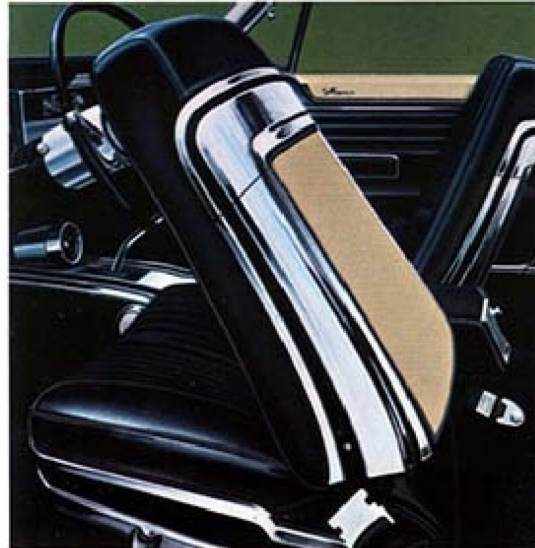
Distinctive wicker-grain front seat trim is a Monaco 500 exclusive.