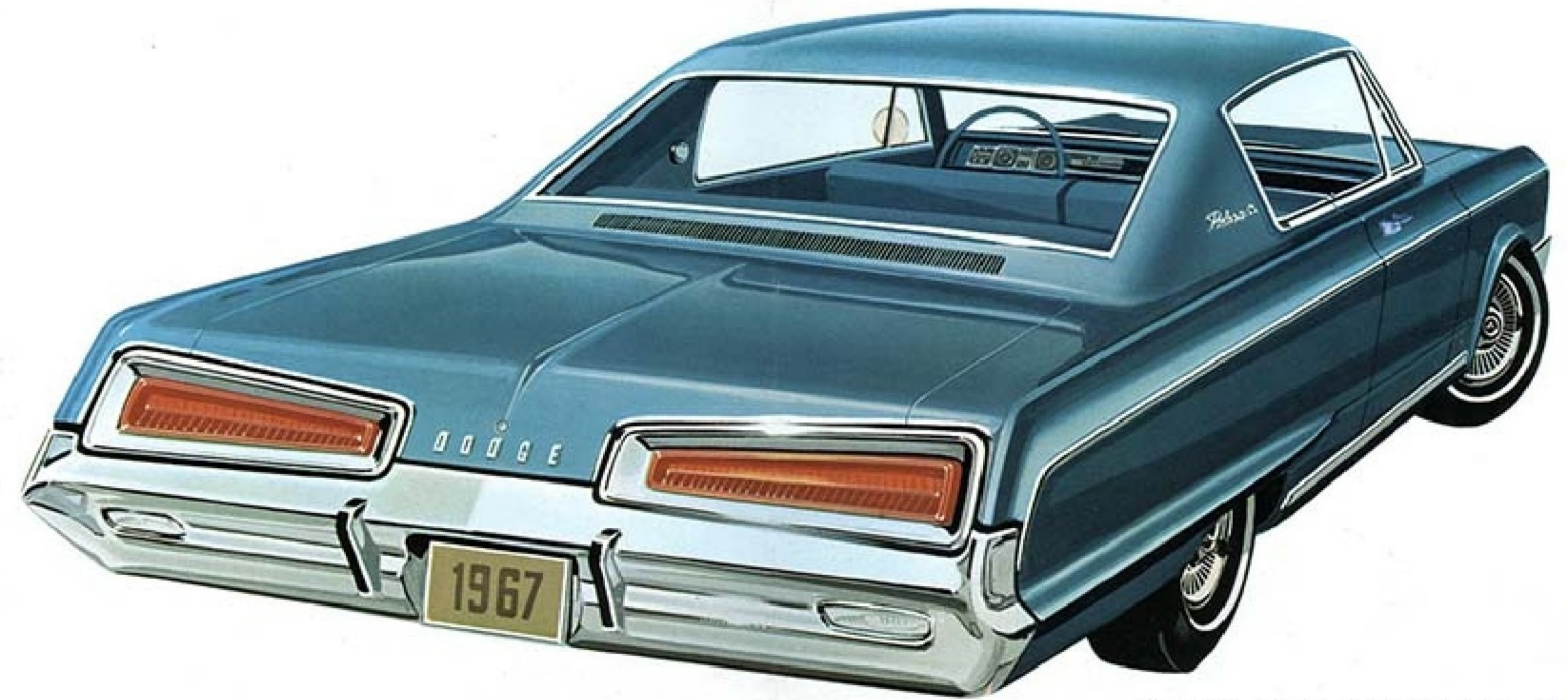
Dodge Polara 2-door hardtop (front bench seat).

*Special, buffed, silver-metallic paint is offered as an additional body color, at extra cost.