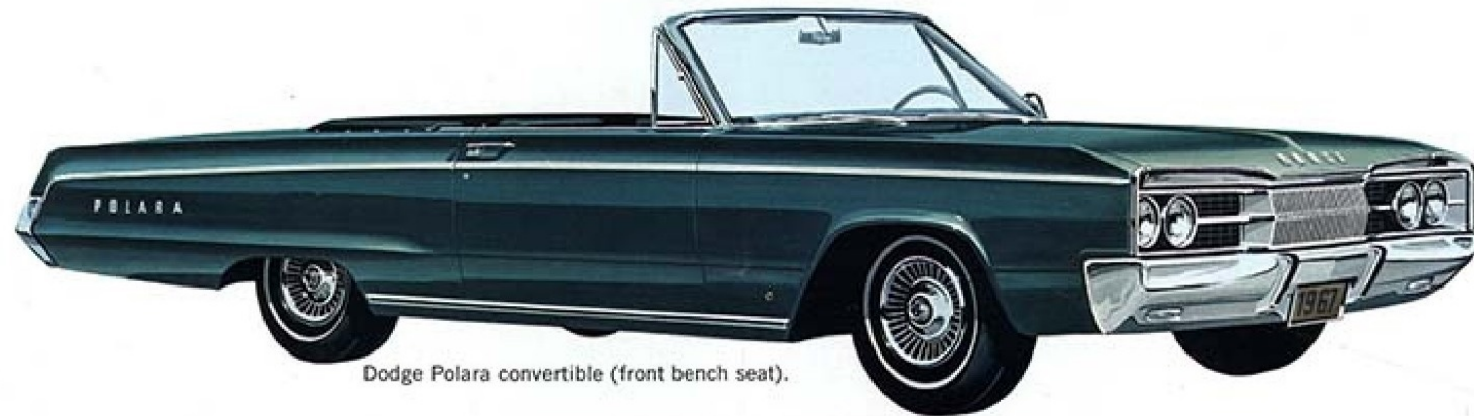
Dodge Polara convertible (front bench seat).