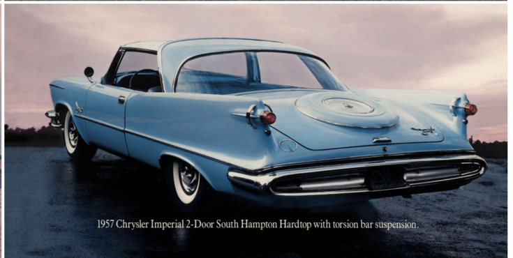
1957 Chrysler Imperial 2-Door South Hampton Hardtop with torsion bar suspension.

Chrysler's known that for over 60 years.