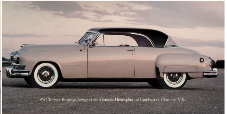
1951 Chrysler Imperial Newport with famous Hemispherical Combustion Chamber V-8.