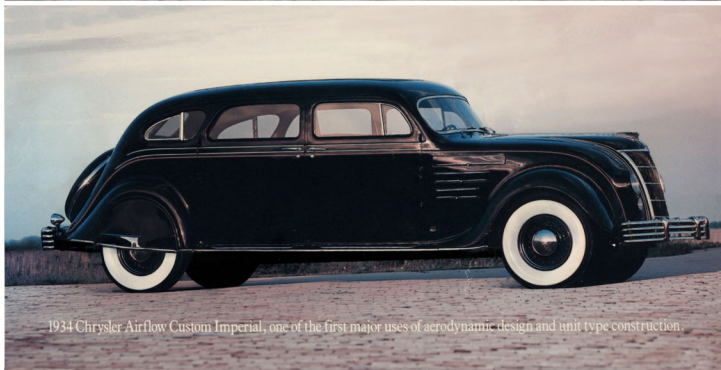
1934 Chrysler Airflow Custom Imperial, one of the first major uses of aerodynamic design and unit type construction.