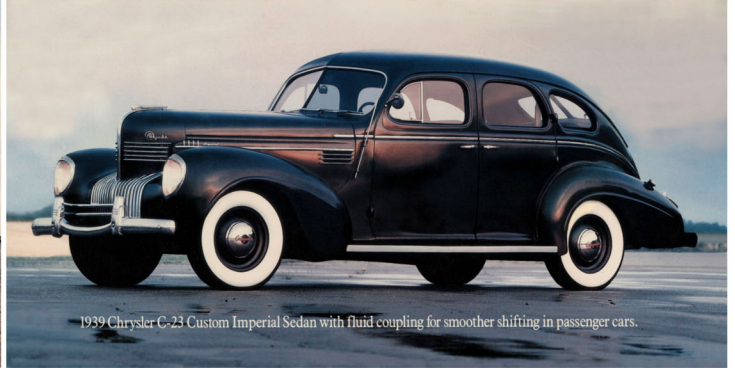
1939 Chrysler C-23 Custom Imperial Sedan with fluid-coupling for smoother shifting in passenger cars.