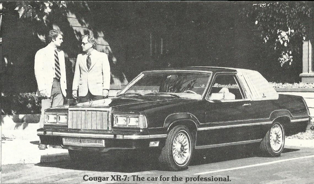
Cougar XR-7: The car for the professional.