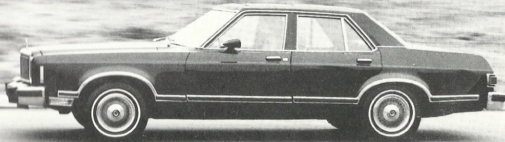
Monarch: It goes the distance.