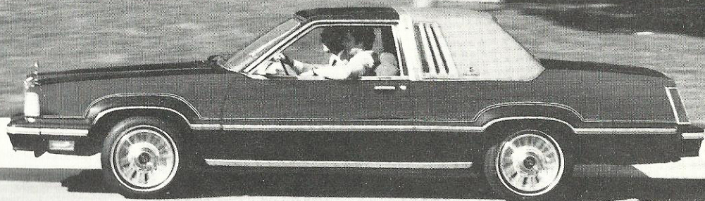
Cougar XR-7: Automatic Overdrive Transmission available with 5.0 liter V-8.