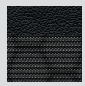
Black cloth/leather combination (synthetic)