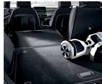
Standard 60/40 split-fold rear seats