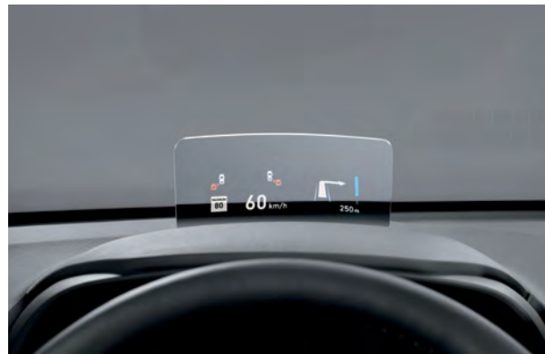
Available Head-Up Display