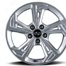
17" alloy wheel Standard on Preferred Special Edition and Preferred models