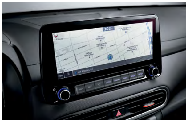
Available 10.25" touch-screen with navigation system