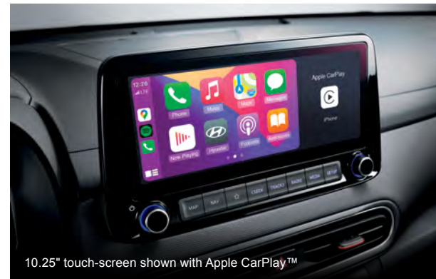
Standard Apple CarPlay™ and Android Auto™ with available wireless connectivity