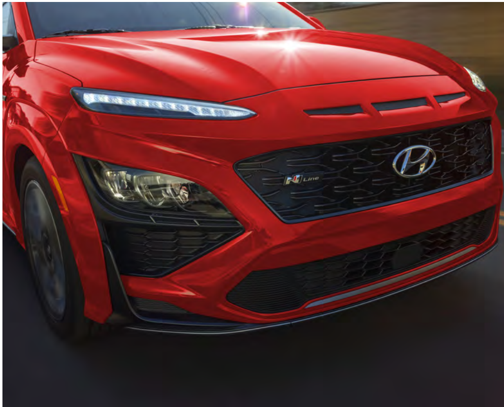
Standard LED daytime running lights Available LED headlights

The new KONA features a distinctive grille design that complements the refreshed headlight cluster. The narrow, piercing look of the standard LED daytime running lights remains a signature and unmistakable design cue. The bold design is reinforced with body cladding details along the wheel arches and rear bumper.