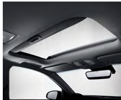
Available power sunroof