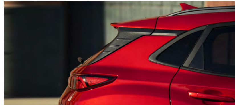
Available LED tail lights Standard rear spoiler