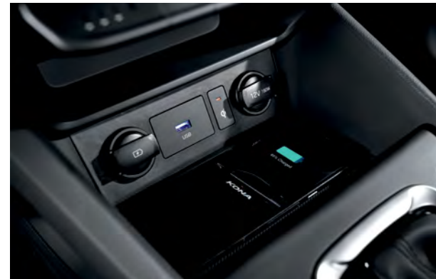
Available wireless charging pad▼