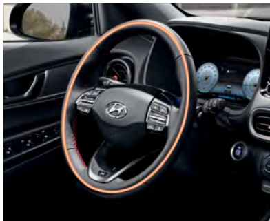
Available heated steering wheel