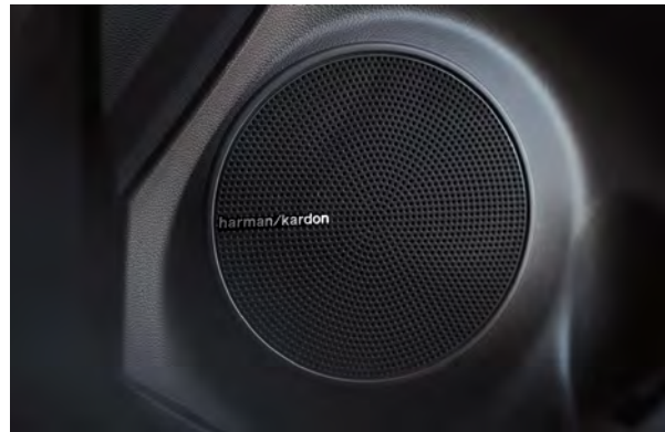
Available harman/kardon® premium audio system with 8 speakers