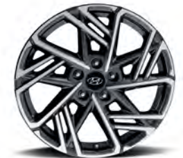
18" alloy wheel Standard on N Line model and N Line model with Ultimate package