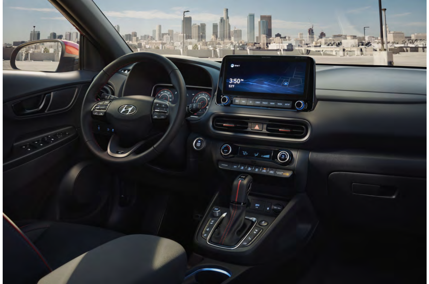
N Line model with Ultimate package shown.

Outside, the newly re-designed KONA makes a bold statement. Inside, the KONA lets its exceptional level of comfort and wealth of features do the talking. The new KONA thinks of you with its standard heated front seats, an available heated steering wheel and an available 8-way power-adjustable driver's seat. When city life heats up, the KONA helps keep you cool with available ventilated front seats.