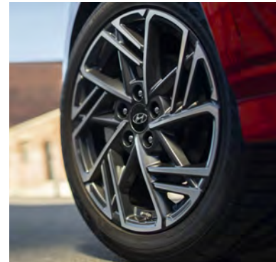
Available 18" alloy wheels