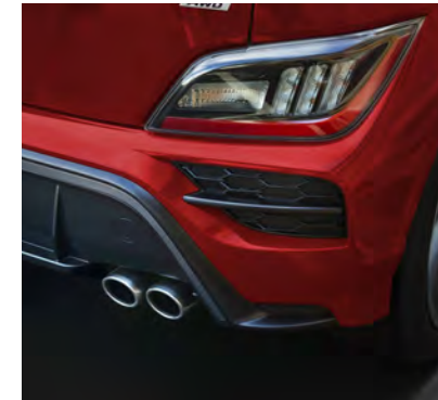
Available twin-tip exhaust