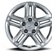
16" alloy wheel Standard on Essential Value Edition and Essential models