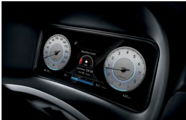
Available 10.25" full digital instrument cluster

Shopping across town? Late-night eats? Get around seamlessly with these impressive features.