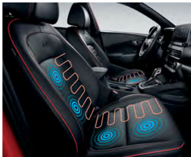
Standard heated front seats Available ventilated front seats