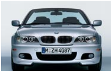
Front air dam that is unique to the Performance Package displays a face that's all business.

The Performance Package, a product of BMW Individual – the division responsible for creating unique, limited-edition BMWs, includes a more muscular engine that boasts 235 hp at 5900 rpm, and 222 lb-ft of torque at just 3500 rpm. The redline has been increased to 6800 rpm from 6500 rpm. Additional features include 18" M Double Spoke alloy wheels and performance tires – 225/40 front, 255/35 rear; Montana leather upholstery, complemented with a choice of two new interior “cube trim” choices; and the M Sport multi-function steering wheel. The Performance Package models are also easily identified by the elegantly aggressive Aerodynamic exterior and the matte stainless steel, 35mm dual exhaust pipes. Alcantara/cloth upholstery is available as a no-cost option for those who prefer not to have all-leather upholstery.