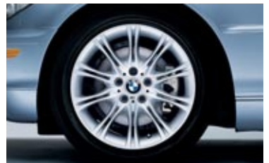
M Double Spoke (Styling 135M) alloy wheels 18 x 8.0 front, 18 x 8.5 rear; 225/R40-18 front, 255/35R-18 rear performance tires. 1 (Only available on 330Ci Performance Package.)