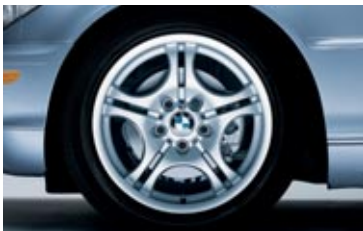
The 330Ci Sport Package includes M Double Spoke (Styling 68M) alloy wheels and performance tires. In front: 17 x 7.5 wheels and 225/45R-17 tires; at the rear: 17 x 8.5 wheels and 245/40R-17 tires. 1