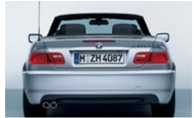
Rear apron: The rear apron, with its integrated diffuser, upgrades the car's aerodynamics.