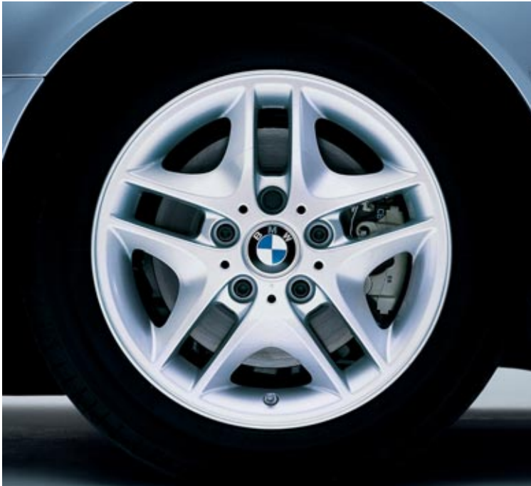
The 325Ci with 16 x 7.0 Double Spoke (Styling 88) alloy wheels, and 205/55R-16 all-season tires.