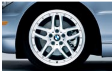
18" Double Spoke Composite (Styling 71) alloy wheels and performance tires can be ordered with the 330Ci Sport Package. In front: 18 x 8.0 wheels and 225/40R-18 tires; at the rear: 18 x 8.5 wheels and 255/35R-18 tires. 1 (opt. with 330Ci Sport Package. Not available with 330Ci Performance Package.)