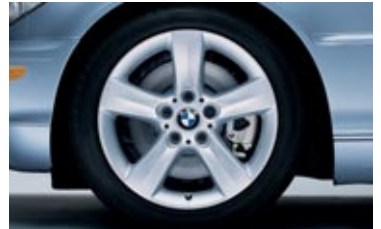
The 325Ci Sport Package includes Five Spoke (Styling 119) 17 x 8.0 cast alloy wheels and 225/45R-17 performance tires. 1