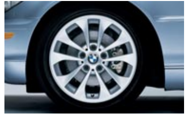
The 330Ci with 17 x 7.0 Double Spoke (Styling 98) alloy wheels, and 205/50R-17 all-season tires.