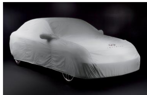
1 carpeted floor mats 2 coupe vehicle cover 2 sedan vehicle cover

1 carpeted floor mats (replacement). Deliver protection and a touch of elegance with premium-quality custom-fit carpeted floor mats, in colors to complement your interior. Constructed of durable cut-pile carpet, these replacement floor mats match the ones that come standard with your G35, and are an excellent way to freshen up your interior. The driver's mat also features a grommet/hook retention system to help keep it in place. (Sedan mats shown.)