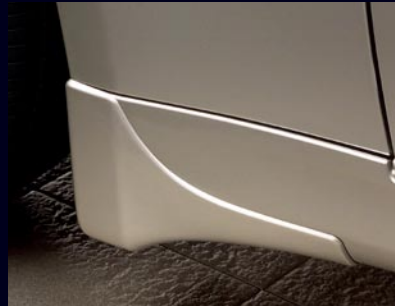
1 sedan splash guard 1 coupe splash guard