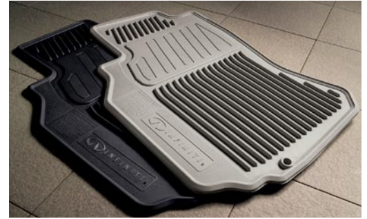
1 all-season floor mats

1 all-season floor mats. Help protect your interior from the elements with these custom-fit, all-season floor mats. Constructed of a durable material, their deep-ribbed channels help trap dirt, mud, snow and water. The driver's mat features a grommet/hook retention system. Available in three colors (wheat, graphite and stone) to complement your vehicle's interior.