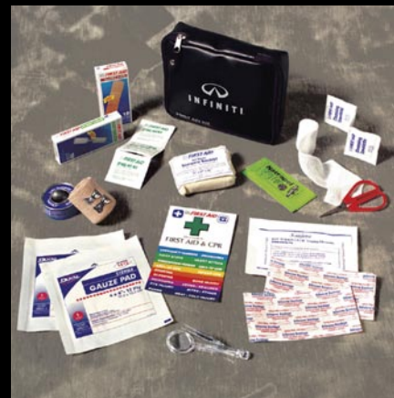
4 first-aid kit

touchup paint. Matched specifically to your vehicle's color, touchup paint bottle comes with "brush-in-cap" applicator.