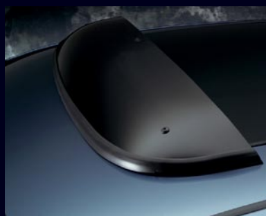
2 body side moldings 3 sunroof wind deflector

1 splash guards. By reducing dirt spray and helping to prevent nicks and scratches caused by road debris, these splash guards add style and value. They're contoured to perfectly fit wheel openings and color-matched to complement all exterior colors.