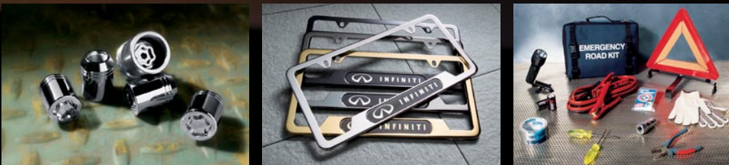
1 wheel locks 2 license plate frames 3 emergency road kit

2 license plate frames. Customize, enhance and add style to the front and rear of your G35's exterior. Constructed of stainless steel for durability and weather-resistance, these license plate frames are available with or without Infiniti logo in several finishes (polished, satin, matte black, black pearl and gold).