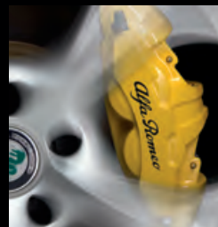
Yellow 4-piston brake calipers Available