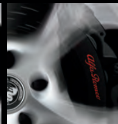
Black 6-piston anodized brake calipers Standard on Quadrifoglio