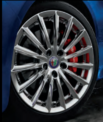
17-inch Bright 15-spoke aluminum wheels Standard on Sprint