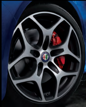
18-inch Bright Double Y-spoke aluminum wheels Standard on Ti