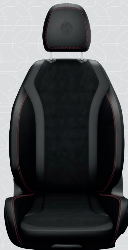
Black leather trim and Alcantara with Red accent stitching