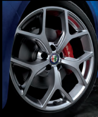
19-inch Bright Y-spoke aluminum wheels Available on Ti