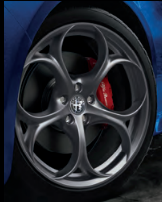
19-inch Dark 5-hole aluminum wheels Standard with Nero Edizione Package on Ti Sport