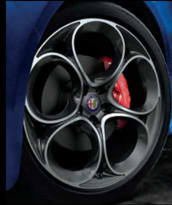
19-inch Sport 5-hole aluminum wheels Available on Ti Sport Included with Carbon Package