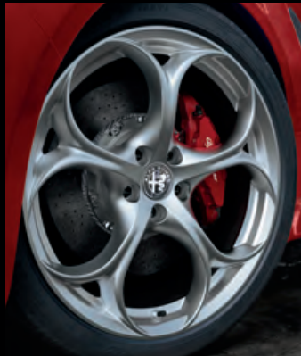
19-inch Bright 5-hole aluminum wheels Available on Quadrifoglio