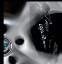
Black 4-piston brake calipers Available