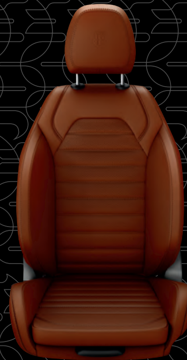
Tan performance Sport leather trim