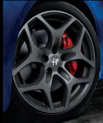
18-inch Dark Double Y-spoke aluminum wheels Included with Nero Edizione Package on Sprint