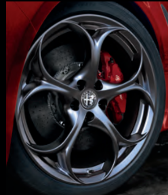
19-inch Dark 5-hole aluminum wheels Available on Quadrifoglio