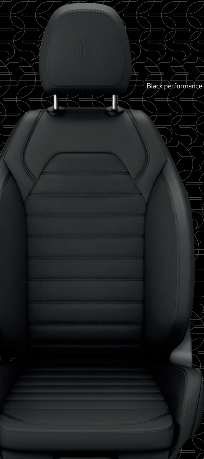
Black performance Sport leather trim