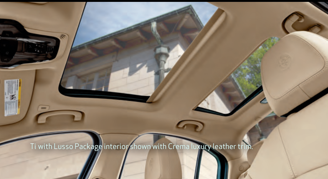
Ti with Lusso Package interior shown with Crema luxury leather trim.

The Alfa Romeo Giulia elevates every excursion with legacy-enhancing details. Materials are selected to be in full harmony with each Giulia model and to uphold a long tradition of skillful artistry. Here, in the Giulia Ti with the Lusso Package, Crema luxury leather Cannelloni-design seats featuring front power 12-way adjust (including 4-way lumbar and driver memory), luxury leather-wrapped steering wheel, leather-wrapped dash with accent stitching, genuine Aluminum accents and genuine Light Walnut Wood trim create a rich, natural feel. The dual-pane sunroof adds to the vista that is Giulia. It's all just a snapshot of the wide-ranging interior choices as outlined in the specification pages.