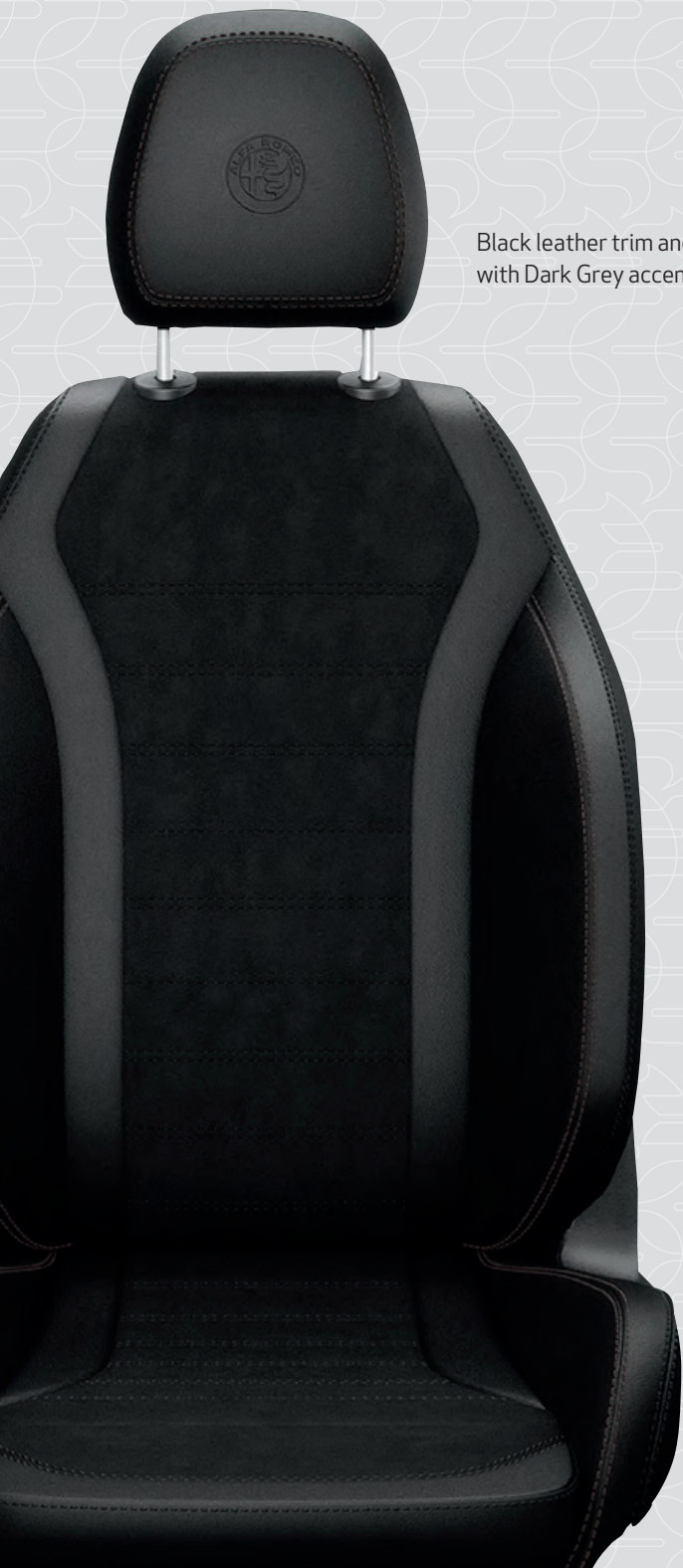
Black leather trim and Alcantara® with Dark Grey accent stitching