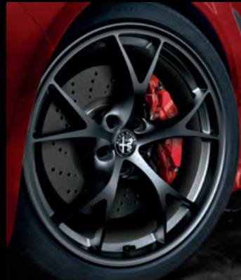
19-inch Dark Tecnico aluminum wheels Available on Quadrifoglio