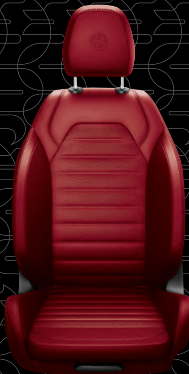
Red performance Sport leather trim