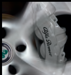
Silver 4-piston brake calipers Standard on Sprint and Ti