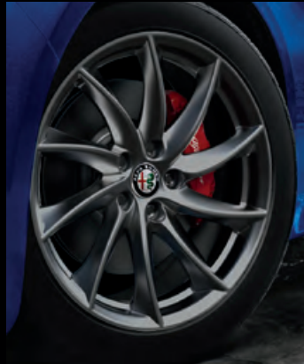
18-inch Dark Turbine aluminum wheels Available on Sprint