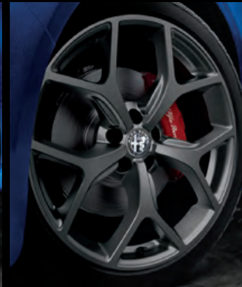
19-inch Dark Miron Y-spoke aluminum wheels Included with Nero Edizione Package on Ti