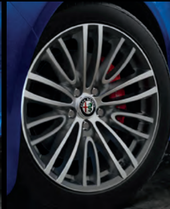
18-inch Lusso aluminum wheels Included with Ti Lusso Package