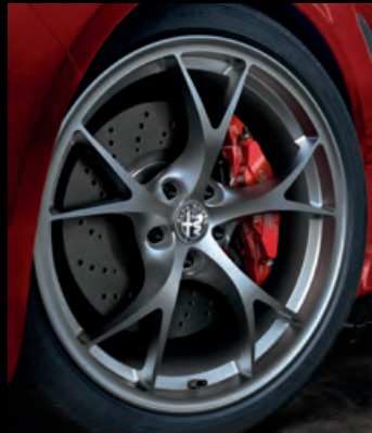
19-inch Bright Tecnico aluminum wheels Standard on Quadrifoglio