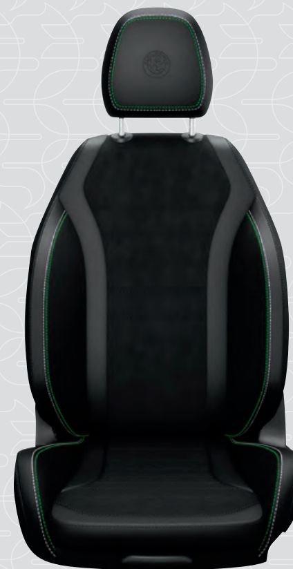
Black leather trim and Alcantara with Green and White accent stitching