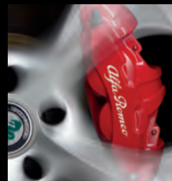
Red 4-piston brake calipers Available