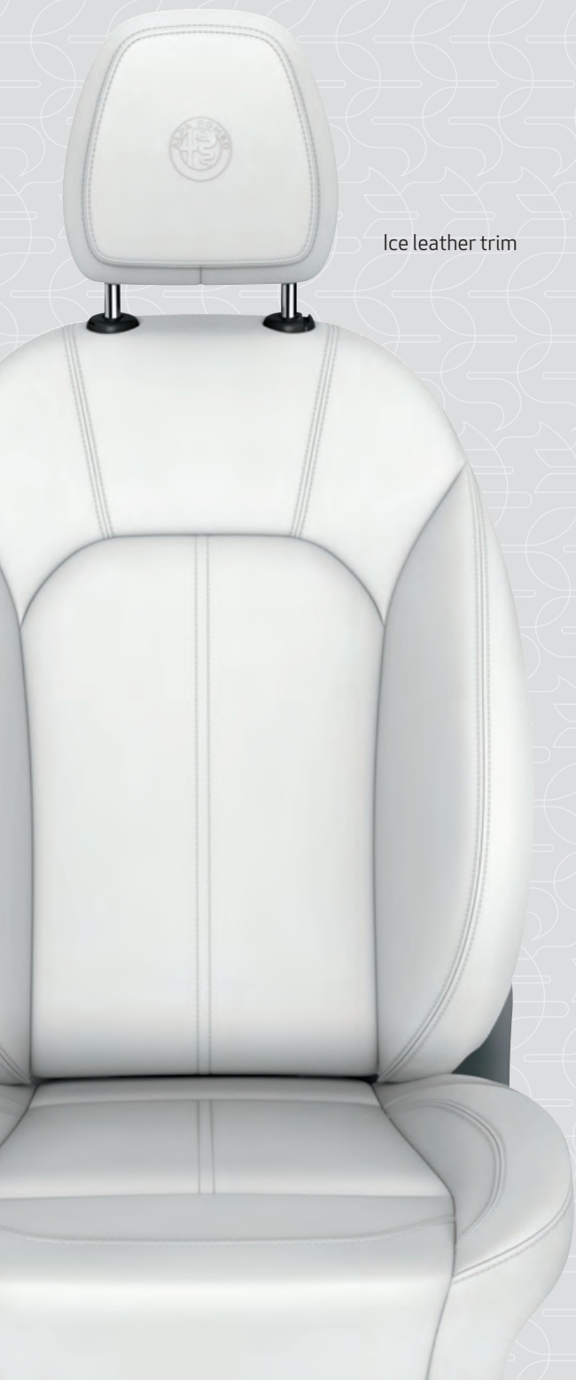
Ice leather trim