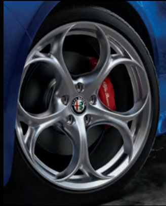
19-inch Bright 5-hole aluminum wheels Standard on Ti Sport