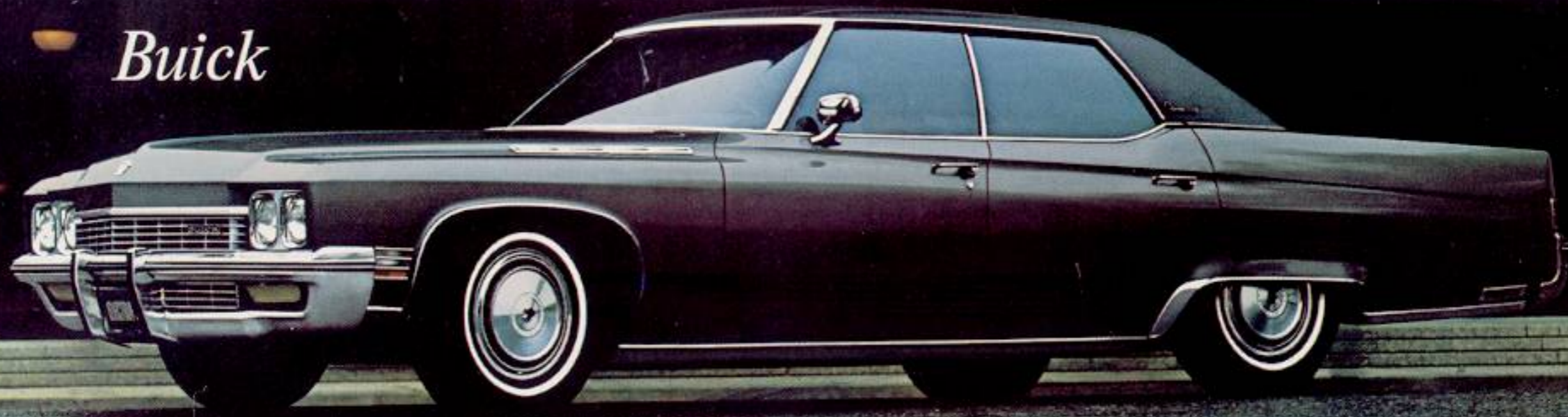
ELECTRA 225 4-Door Hardtop

Buick's luxurious 1972 ELECTRA 225 models feature improved front bumper protection; smooth, quiet operation; and excellent riding qualities. Buick's Electra 225's offer the same handling and performance features that have made this series distinctive among American automobiles.