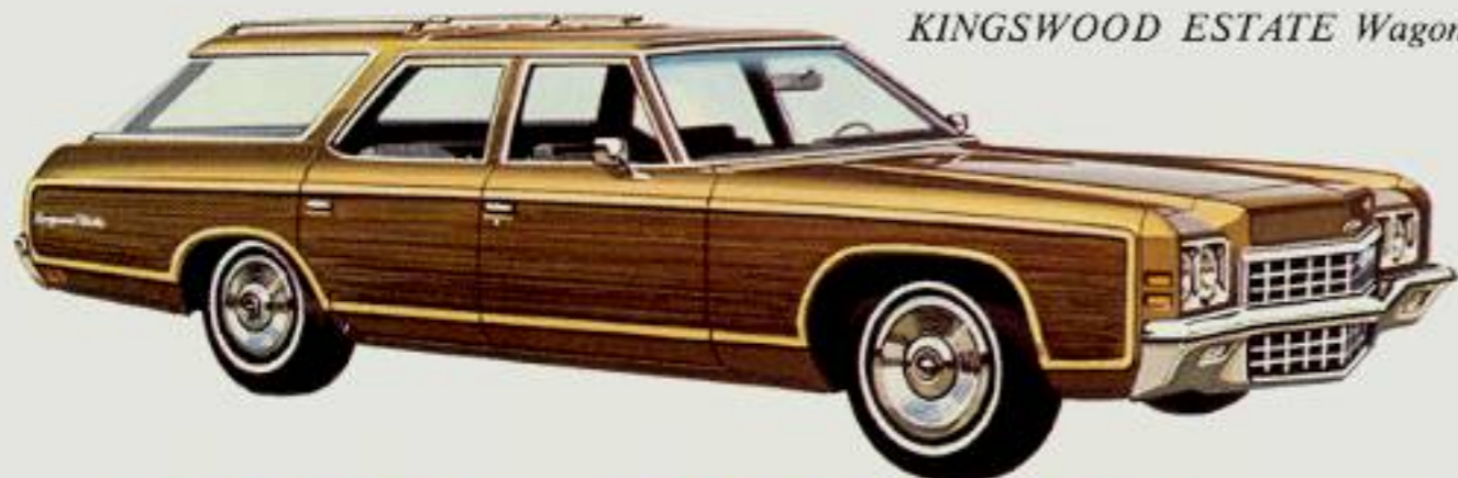
KINGSWOOD ESTATE Wagon

Family-size room. Family-size comfort. Family-size fun. Whatever your needs, Chevrolet's station wagon line-up for 1972 can fill the bill. Available in 14 models, there are two sizes to choose from—the big 125" wheelbase or the mid-size 116" wheelbase.