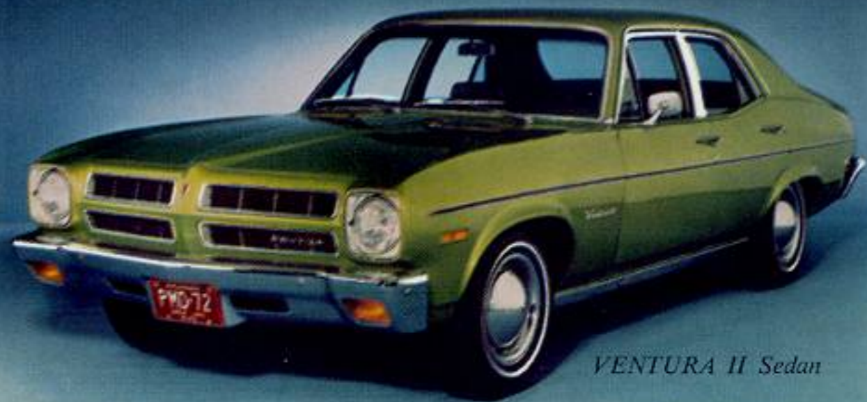
VENTURA II Sedan

Low in price and easy to service, Pontiac's VENTURA II features a 250-cubic-inch six-cylinder engine. This compact economy car is available in two-door and four-door models.