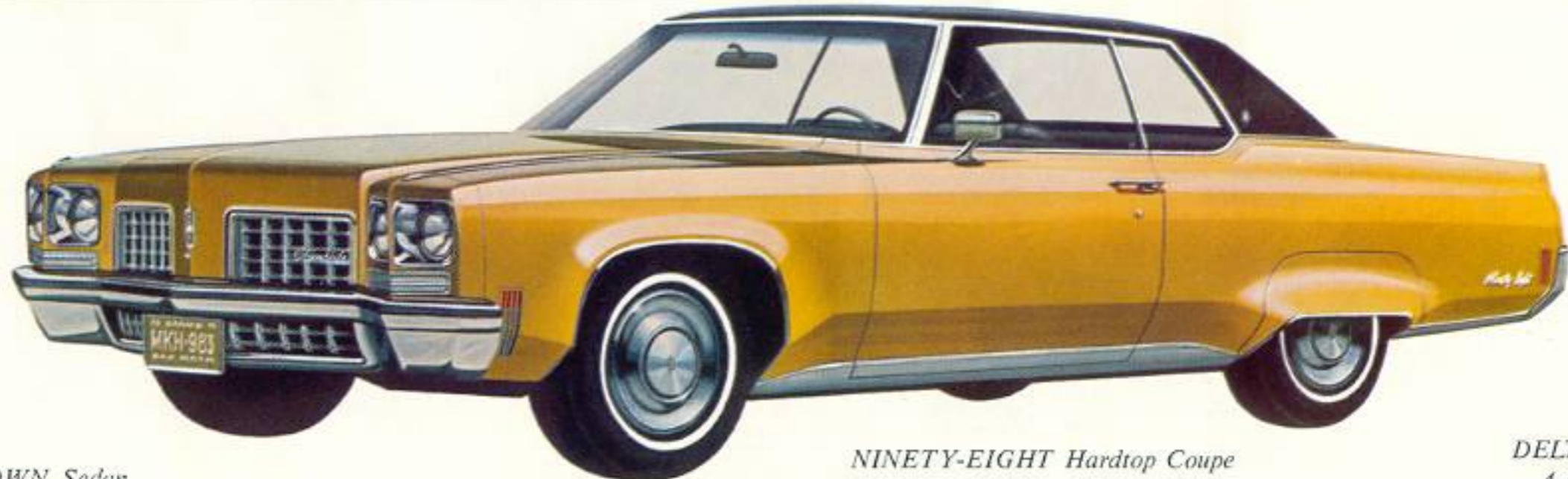
DELTA 88 TOWN Sedan

Ride, comfort, handling, engine performance, and fresh styling combine to make Oldsmobile's NINETY-EIGHT, DELTA 88 ROYALE and DELTA 88 the finest in history. These models feature an innovative spring steel front bumper