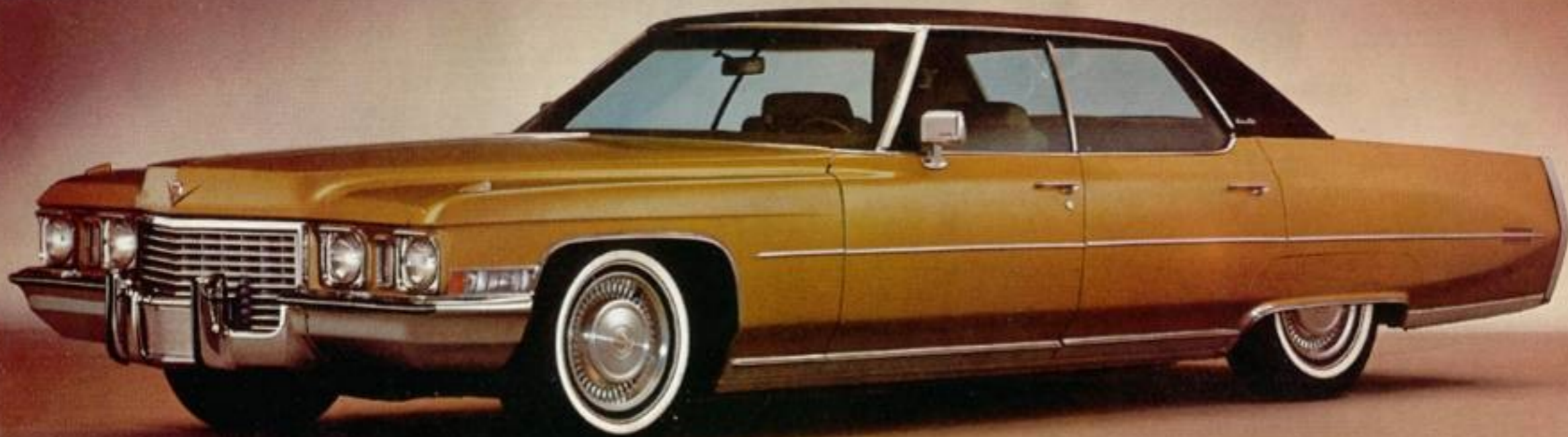
SEDAN DE VILLE