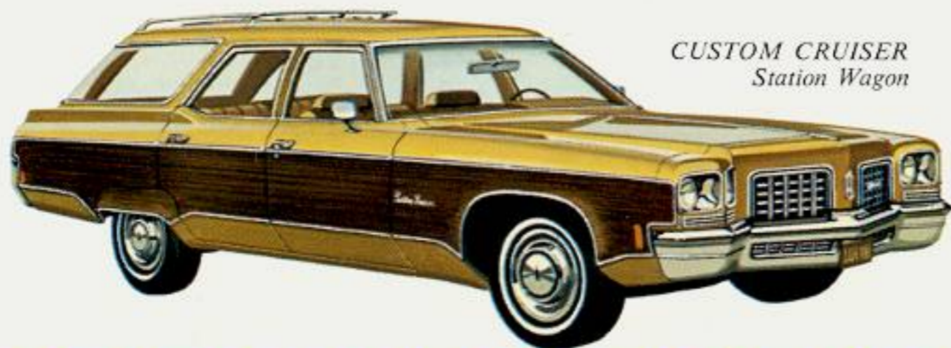
CUSTOM CRUISER Station Wagon

The CUSTOM CRUISER features power steering, power brakes (with front discs), automatic transmission, Glide-Away Tailgate and a 455-cubic-inch V8 engine as standard equipment. The VISTA-CRUISER with 100-plus-cubic-foot cargo space is available with a forward-facing third seat.