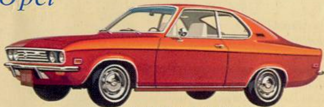
1900 2-Door Sport Coupe

The 1972 OPEL is an ideal combination of comfort, maneuverability and economy. A low price tag and a smooth 1.9 liter engine have helped establish Opel's popularity. Opel is sold in the U.S. through more than 2,200 Buick-Opel dealers.