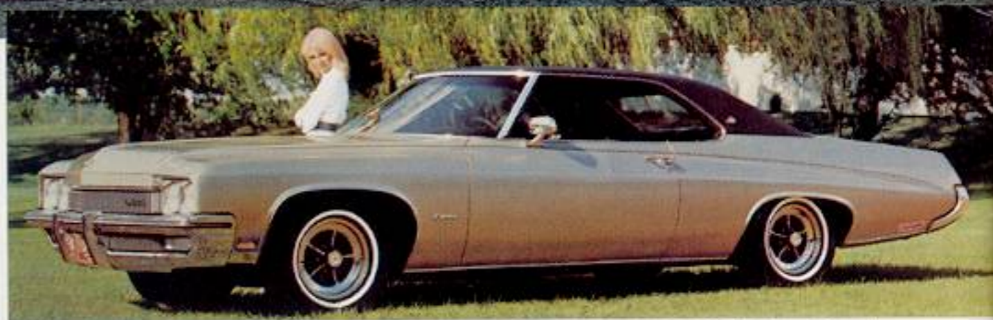
CENTURION 2-Door Hardtop

Buick's luxurious 1972 ELECTRA 225 models feature improved front bumper protection; smooth, quiet operation; and excellent riding qualities. Buick's Electra 225's offer the same handling and performance features that have made this series distinctive among American automobiles.