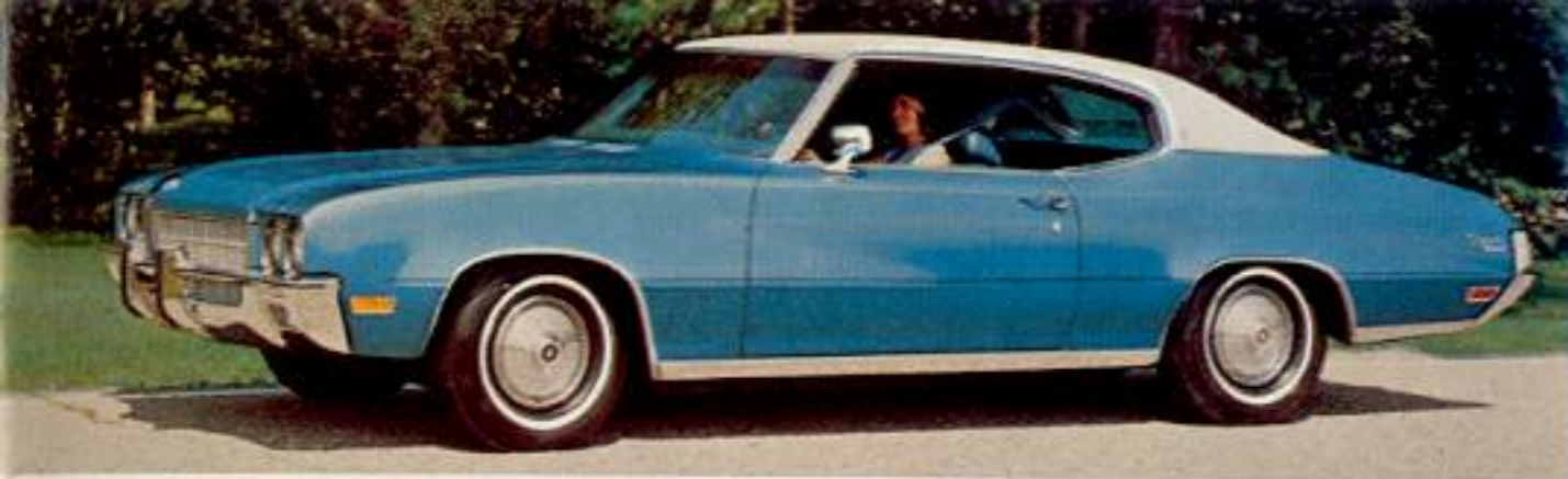
SKYLARK CUSTOM 2-Door Hardtop

A number of refinements, including new optional bumper protective strips, highlight the 1972 SPORT WAGON, SKYLARK and GS models. Easy to handle, thrifty to run and fun to own, all ten Buick intermediates feature a 350-cubic-inch V8 engine as standard equipment.