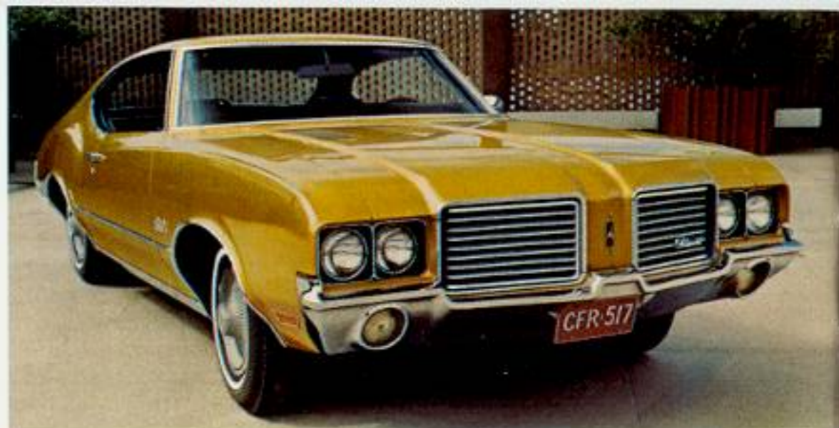
CUTLASS S Hardtop Coupe

Oldsmobile's intermediate-size CUTLASS SUPREME and CUTLASS S models feature good taste and luxury in an easy-handling size, while the handsome and sporty CUTLASS and F-85 series continue to offer the value and economy that have made them so popular.