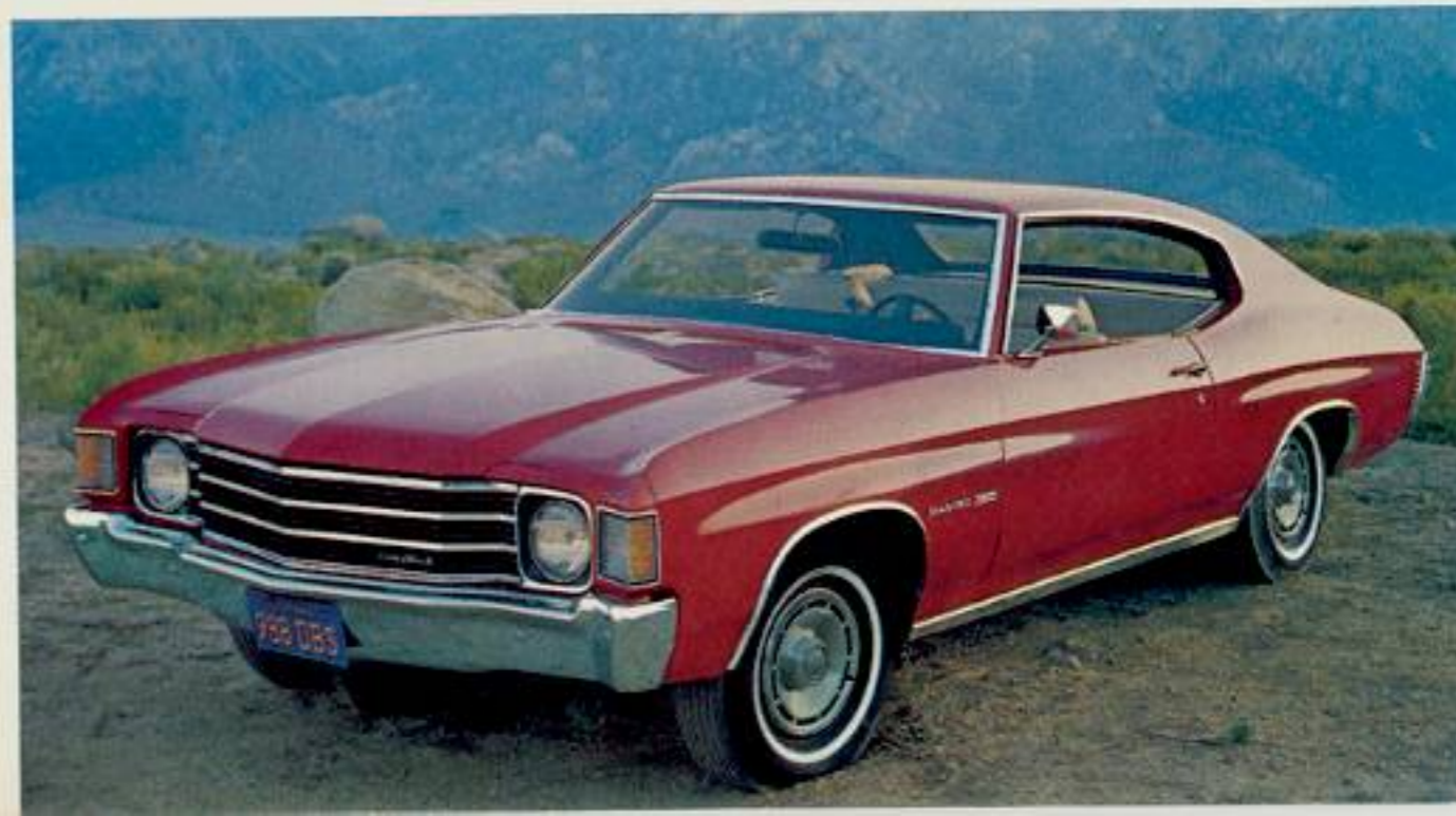
CHEVELLE MALIBU Sport Coupe

CHEVELLE, offered in six models, is trim in size, richly appointed, attractively styled and appealingly priced. Standard engines are a Turbo-Thrift 250-cubic-inch Six and a Turbo-Fire 307-cubic-inch V8. The SS option for the Malibu Sport Coupe or Convertible includes power brakes (with front discs), sport suspension, white lettered tires and special exterior ornamentation.