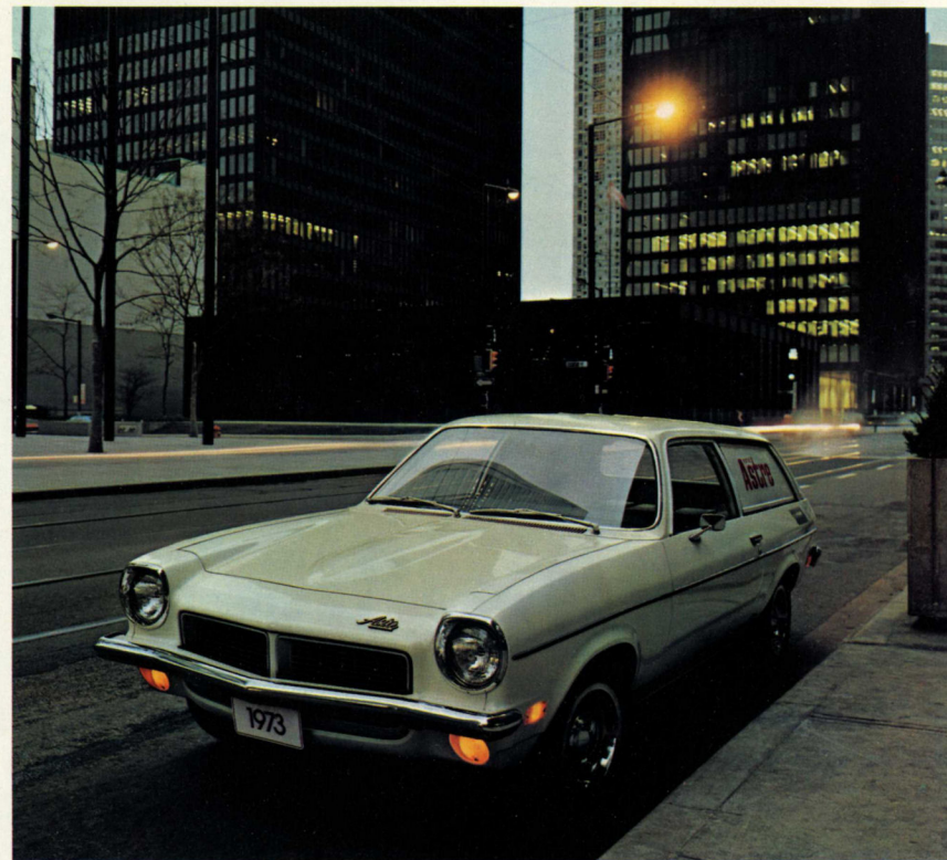
Astre Panel at work in downtown Toronto.