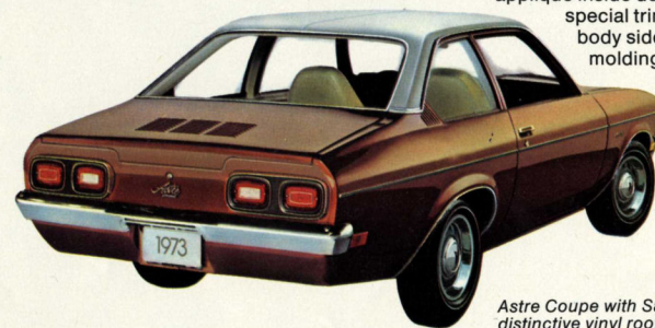
Astre Coupe in the Badlands outside Drumheller, Alta.

As for room, the more formal roof line of the Astre Coupe gives it an edge in passenger space over the Hatchback (page 3), in the back seat particularly. Up front, the Coupe rivals many full-size cars in legroom and headroom.