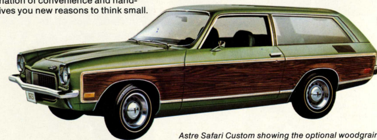
Astre Safari Custom showing the optional woodgrain panelling.

Safari Custom. This extra-cost option package gives you the exterior woodgrain panelling plus an adjustable driver's seatback, Custom Cushion steering wheel, woodgrain panels inside the doors, rear ashtrays, wheel trim rings and special trim inside and out. Right on!