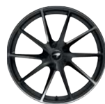
Satin Diamond cut finish