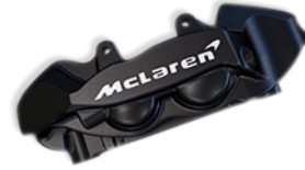
Black with printed McLaren logo