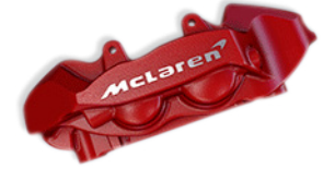
Red with machined McLaren logo