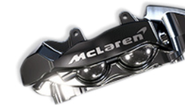
Polished with machined McLaren logo