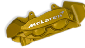
Yellow with machined McLaren logo