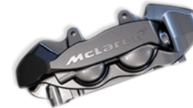
Silver with machined McLaren logo