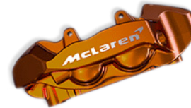
Azores with machined McLaren logo