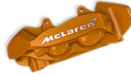
McLaren Orange with machined McLaren logo