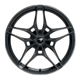
Satin Diamond cut finish

Super-Lightweight 10-Spoke forged alloy wheels