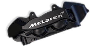
Black with machined McLaren logo