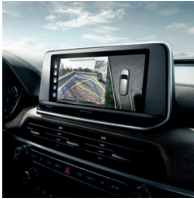
10.25-inch Touch Screen 5