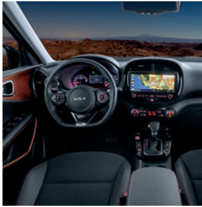
10.25-inch Touch Screen 5*