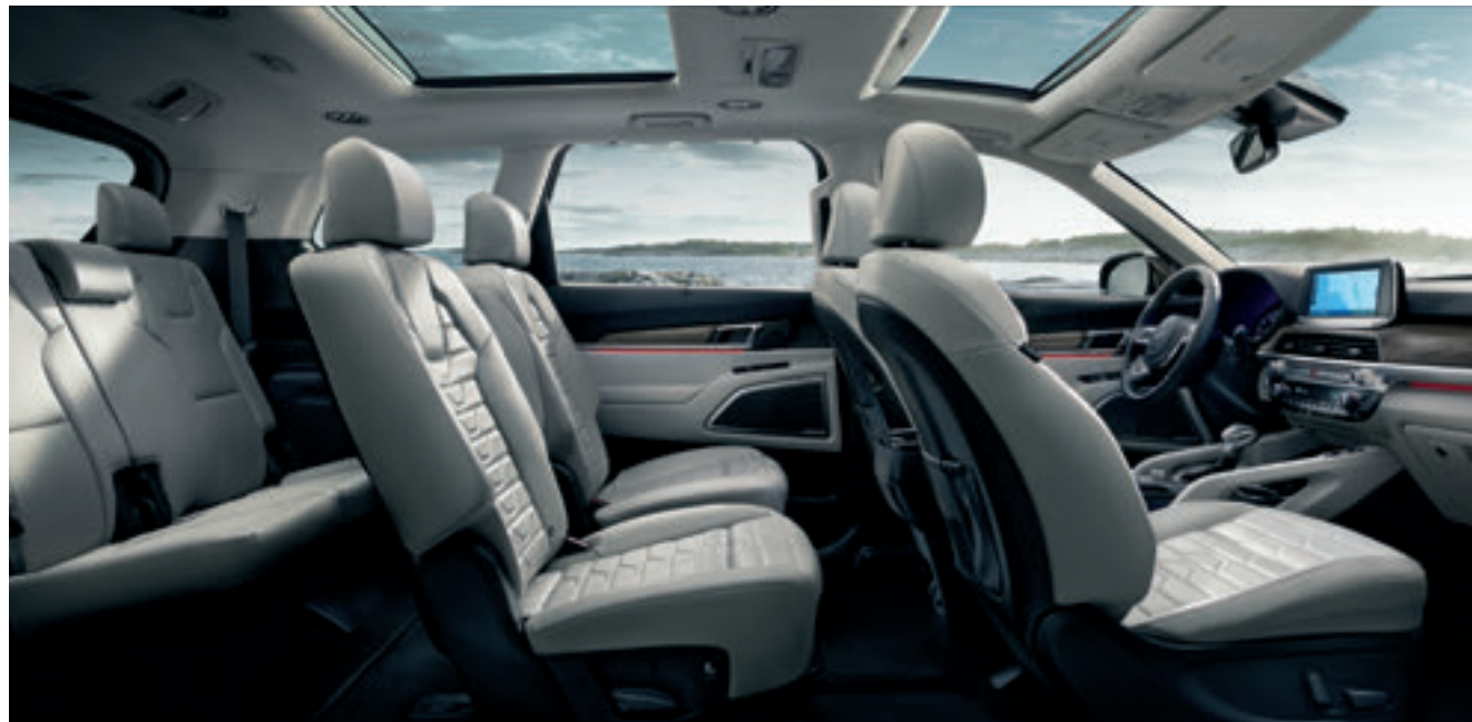
Seats 8 Passengers *