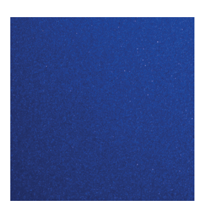
Snow White Pearl Neptune Blue