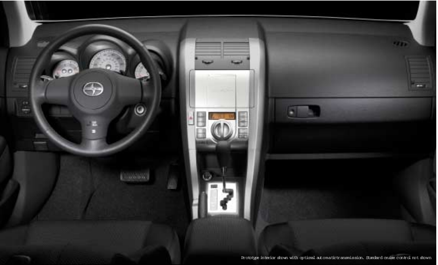
Prototype interior shown with optional automatic transmission. Standard cruise control not shown