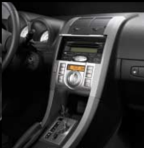
Standard Pioneer audio behind manually retractable cover