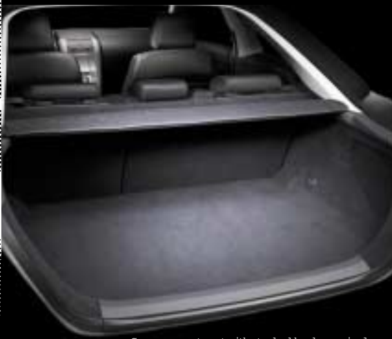
Cargo compartment with standard hard cover in place