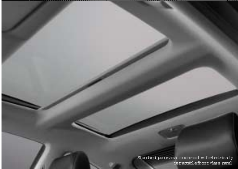
Standard panoramic moonroof with electrically retractable front glass panel.