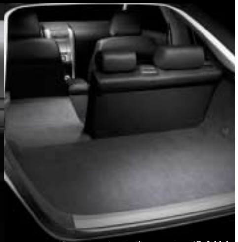
Cargo compartment with rear seat partially folded