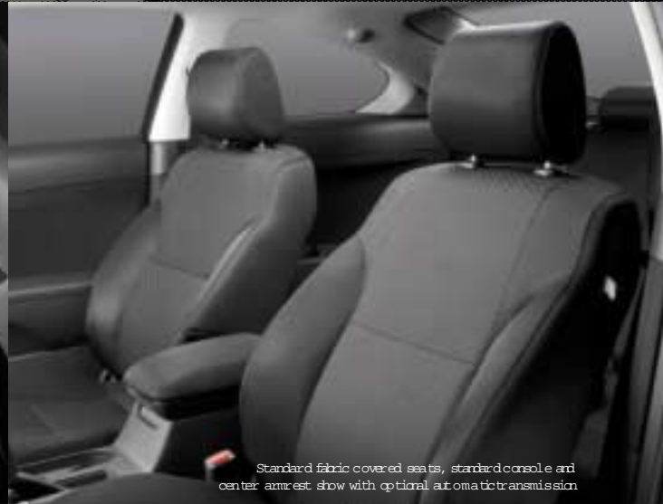
Standard fabric covered seats, standard console and center armrest show with optional automatic transmission.

With standard features like a Panorama Moonroof with power retractable front glass panel, a Pioneer audio system, and 17" Alloy Wheels trimmed in Graphite finish, people will think you paid a lot for your tC. Don't worry, you're secret is safe with us. To learn what features come standard on the tC, refer to the chart on the inside cover.