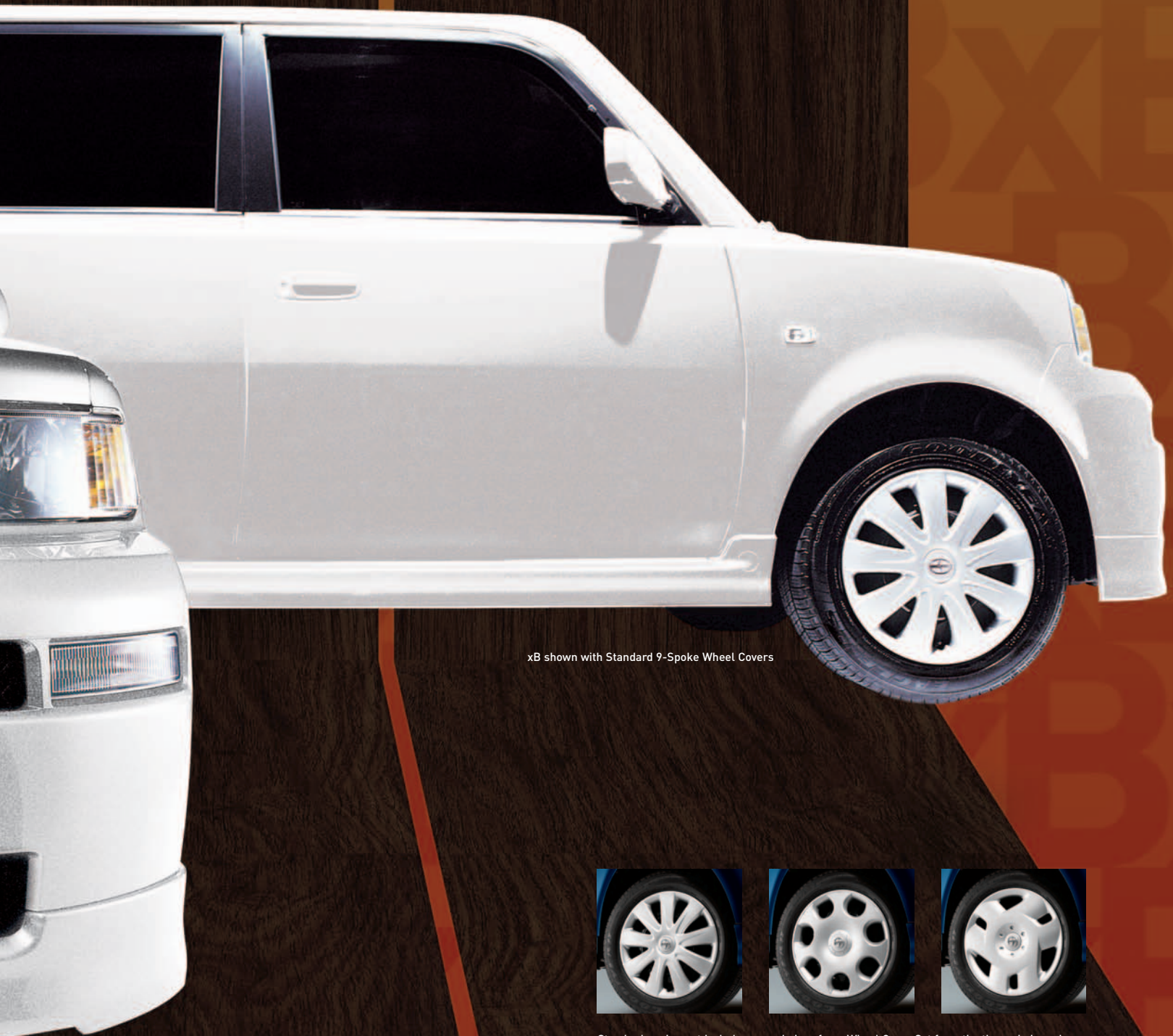
xB shown with Standard 9-Spoke Wheel Covers