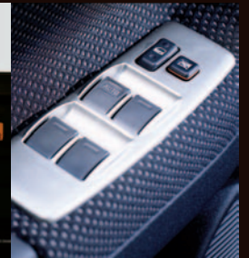
Standard Power Windows and Door Locks