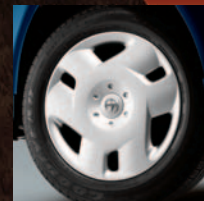
Standard equipment includes your choice of one Wheel Cover Set from the three choices shown