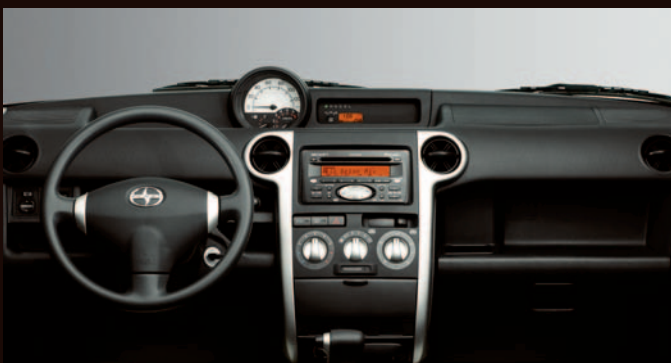
xB Instrument Panel shown with Standard Air Conditioning, Pioneer Audio with Optional 6-Disc Changer and Optional Automatic Transmission