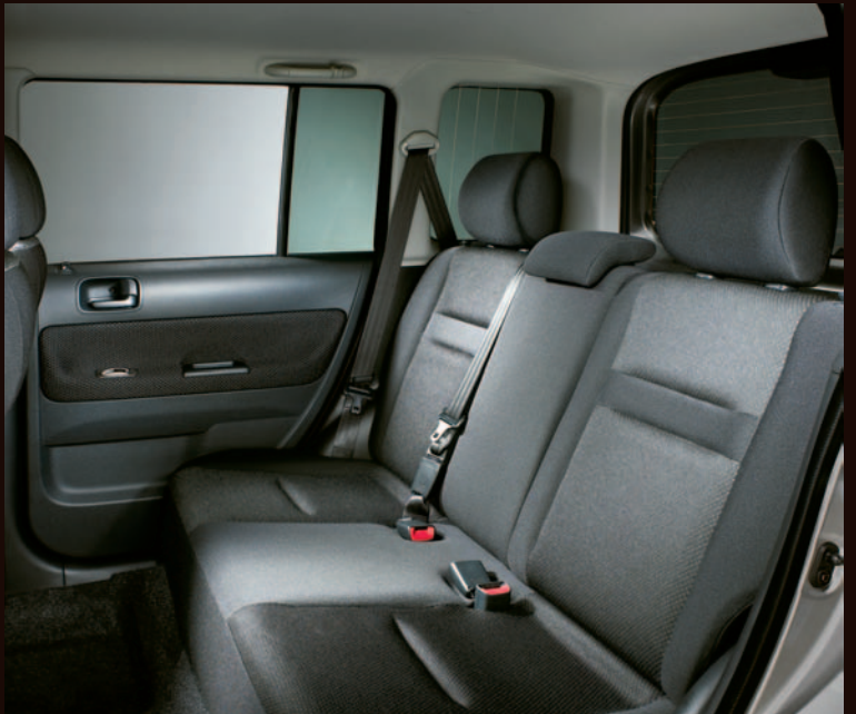
Standard Rear Cloth Seats