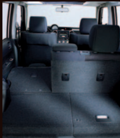
Standard 60/40 Folding Rear Seat