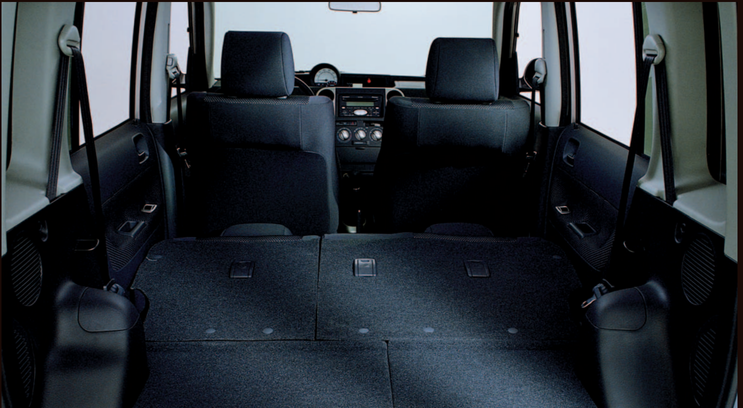
Expanded Cargo Area with Rear Seats Folded Down