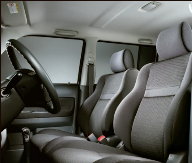
Standard Bucket Seats with Optional Automatic Transmission