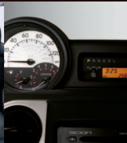
Standard Center-Mounted Speedometer and Tachometer