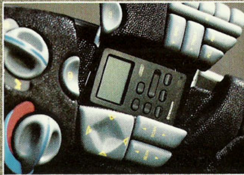
CD PLAYER REMOTE CONTROL