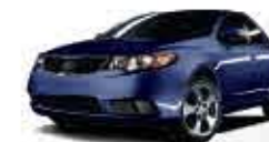
Electric Blue (M) BC/BL