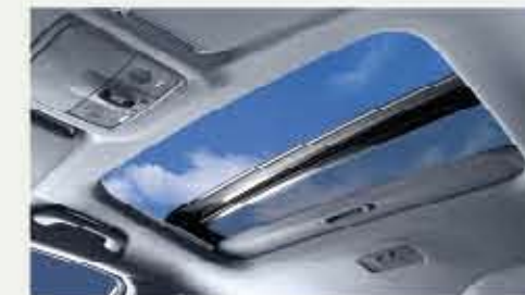
POWER TILT AND SLIDING SUNROOF offers the added exhilaration of open-air driving. What better way to enjoy a beautiful day? It's standard on SX and optional on EX models.