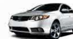
Pure White BC/BL