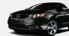
Black Orchid BC/BL