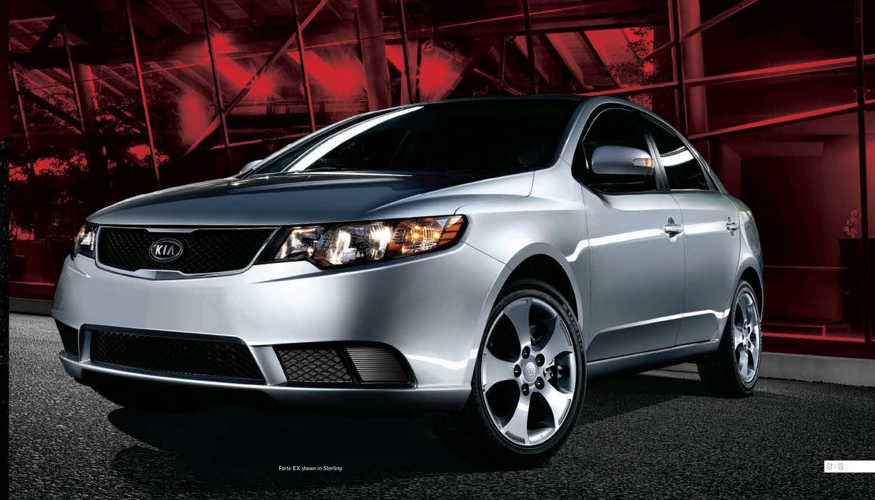
Forte EX shown in Sterling

THE ALL-NEW 2010 FORTE TIRD ORLDRIVE ORTE FE.