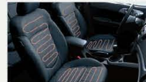
HEATED FRONT SEATS take the chill out of winter driving. They're standard on the EX and SX.