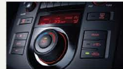
AUTOMATIC CLIMATE CONTROL brings year-round, set-and-forget comfort and it's standard equipment on the SX. Manual air conditioning is standard on EX and available on LX models.