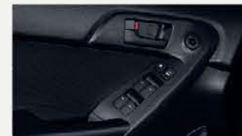
POWER WINDOWS are standard on every Forte. They include a quick and convenient one-touch-down function for the driver's window to help speed you through any drive-thru.