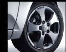
16" 5-spoke alloy wheels