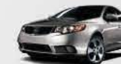
Titanium (M) BC/BL

BC = Black cloth, BL = Black leather, M = Metallic paint The exterior and interior colours in this brochure are as close to the actual vehicle production colours as the printing process allows.