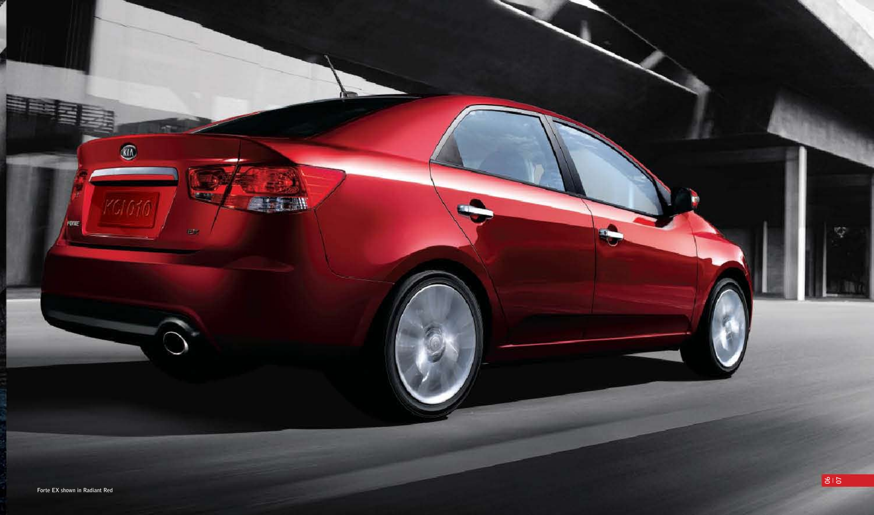
Forte EX shown in Radiant Red

A meticulously engineered chassis and four-wheel independent suspension work in harmony, blending dynamic handling and ride comfort. Under the hood, Forte LX and EX models provide a responsive 156-horsepower from a 2.0-litre engine with continuously variable valve timing (CVVT) for outstanding fuel economy, while the 2.4-litre dual CVVT engine in the Forte SX puts an exuberant 173 horsepower at your command.