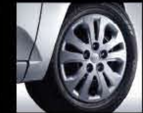
15" steel wheels with full covers