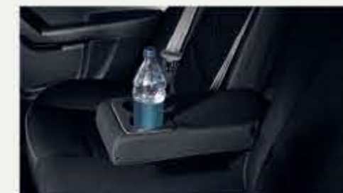
REAR CENTRE ARMREST includes handy cupholders for your passengers. The standard 60:40 split seatbacks also fold down to accommodate oversized cargo when you need the added space.