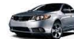
Smoky Grey (M) BC/BL