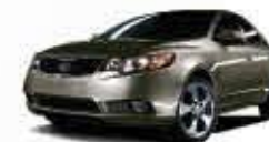
Bronze (M) BC/BL