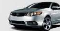
Sterling (M) BC/BL