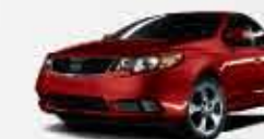
Radiant Red (M) BC/BL