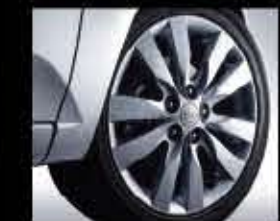
17" 10-spoke alloy wheels