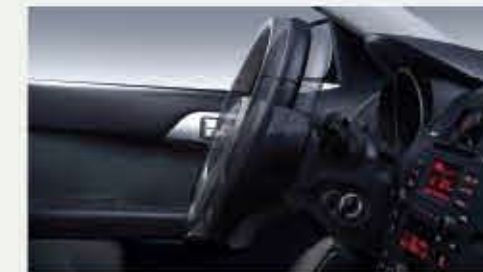
TILT AND TELESCOPING STEERING WHEEL lets you position the wheel precisely where you want it. This control-enhancing comfort feature is standard on EX and SX models.