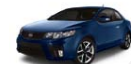
Electric Blue (M) BC/BL