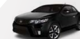
Black Orchid BC/BL