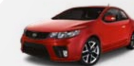
Racing Red BC/BL