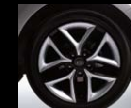
17" alloy wheels