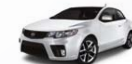
Pure White BC/BL