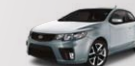
Sterling (M) BC/BL