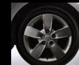
16" alloy wheels