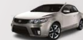
Titanium (M) BC/BL

BC = Black cloth, BL = Black leather, M = Metallic paint The exterior and interior colours in this brochure are as close to the actual vehicle production colours as the printing process allows.