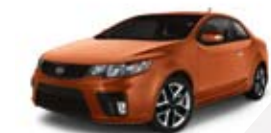
Burnt Orange (M) BC/BL