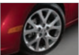
18" alloy wheels (GT)