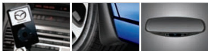
Pictured above from left to right: iPod adapter 3 , Mud guards, Auto-dimming mirror with compass and HomeLink®