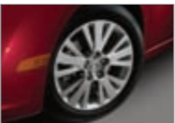
17" alloy wheels (GS)