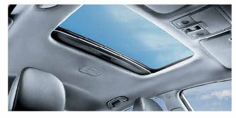
POWER SUNROOF. The power tilt and sliding sunroof lets you enjoy driving in natural light and the open air any time you choose, and is available on all Forte models.

With its long wheelbase and well thought-out use of space, every occupant will enjoy Forte's roomy interior. Available soft-touch materials and carbon fibre patterned trim are among the finishing touches that give the entire cabin a high-quality, modern feel. Split-folding rear seats are standard on all models and provide the flexibility to handle various passenger and cargo loads.