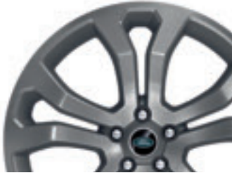
22" Forged Five Split-Spoke Technical Grey Finish Alloy Wheels