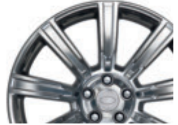
21" Forged Nine-Spoke Machine Polished Finish Alloy Wheels