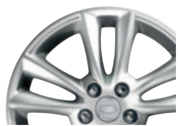
19" Five Split-Spoke Sparkle Silver Finish Alloy Wheels