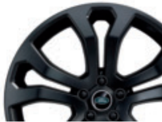
22" Forged Five Split-Spoke Gloss Black Finish Alloy Wheels