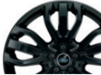
21" Five Split-Spoke Gloss Black Finish Alloy Wheels