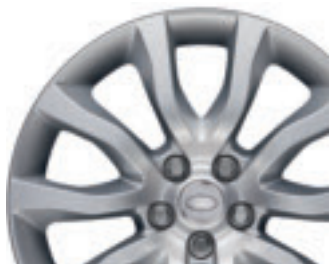
20" Five Split-Spoke Alloy Wheels