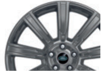
21" Forged Nine-Spoke Technical Grey Finish Alloy Wheels