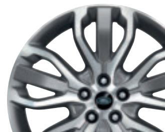
21" Five Split-Spoke Diamond Turned Finish Alloy Wheels