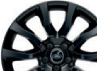
20" Five Split-Spoke Gloss Black Finish Alloy Wheels