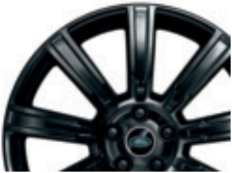
21" Forged Nine-Spoke Gloss Black Finish Alloy Wheels