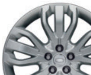
21" Five Split-Spoke Alloy Wheels