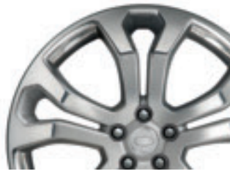
22" Forged Five Split-Spoke Machine Polished Finish Alloy Wheels