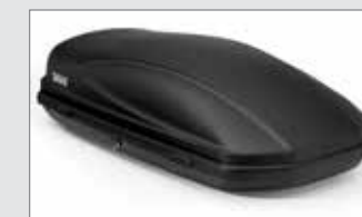
Roof cargo box