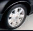
DTS Standard 17"x7" cast with Goodyear Eagle LS P235/55HR-17 H-rated blackwall