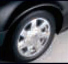
DTS Optional 17"x7" chrome with Goodyear Eagle LS P235/55HR-17 H-rated blackwall