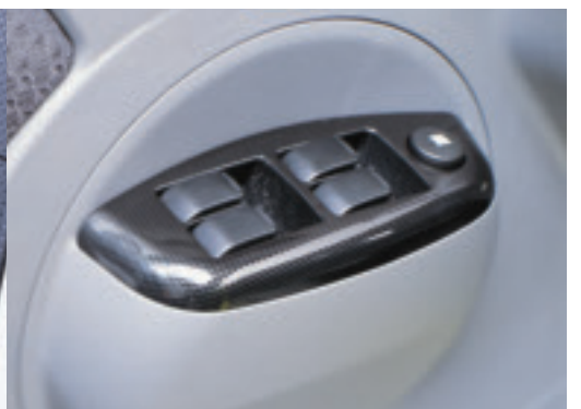
POWER WINDOWS (S MODEL)