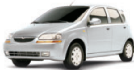
TITANIUM SILVER METALLIC