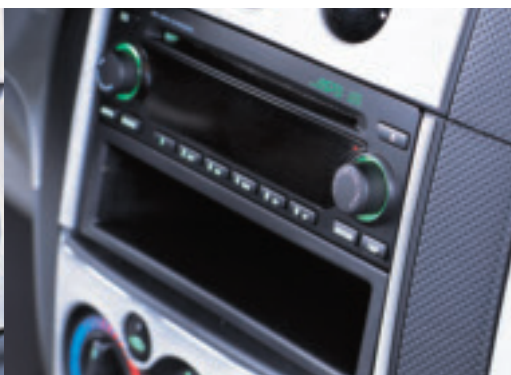
AM/FM/CD PLAYER WITH 4 SPEAKERS