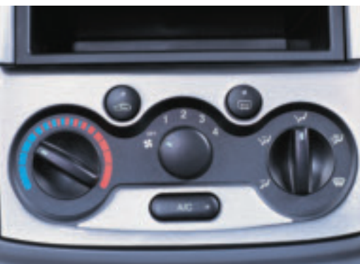
AIR CONDITIONING (S MODEL)