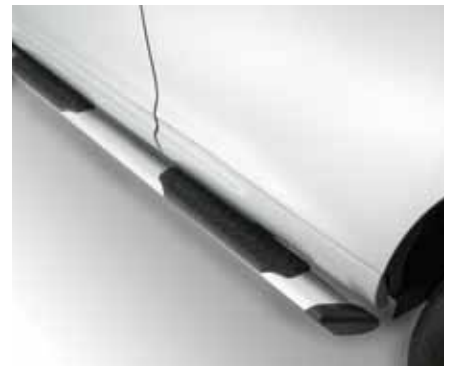
Side Step Bars