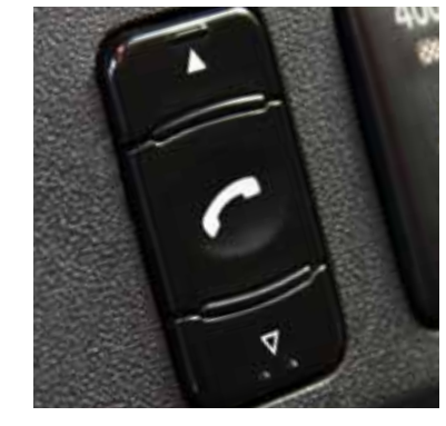
Bluetooth®4 Keep your hands on the wheel and your eyes on the road as you talk conveniently and safely through the Bluetooth®4 hands free system.