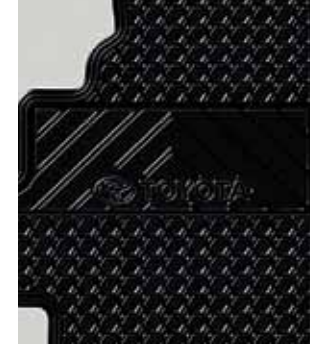
All-Season Mats Safeguard your vehicle's interior against mud, slush and salt with custom-fitted All-Season Mats.