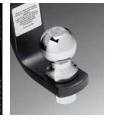
Towing Accessories Haul with confidence with a towing hitch.