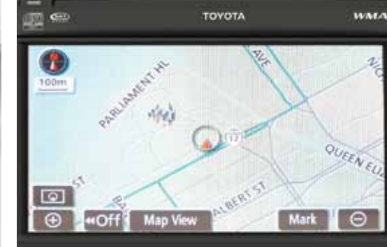
Navigation System<sup>5</sup> Find any destination with the push of a button.