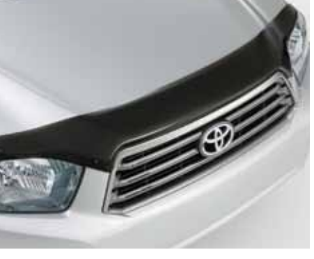
Hood Deflector Protect your vehicle with a high impact deflector that minimizes damage caused by road debris, pebbles and insects.