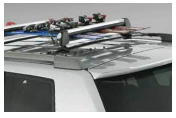
Roof Rack Ski/Snowboard Carrier For the winter sports lover, it's a convenient and easy way to carry a snowboard or up to two pairs of skis.