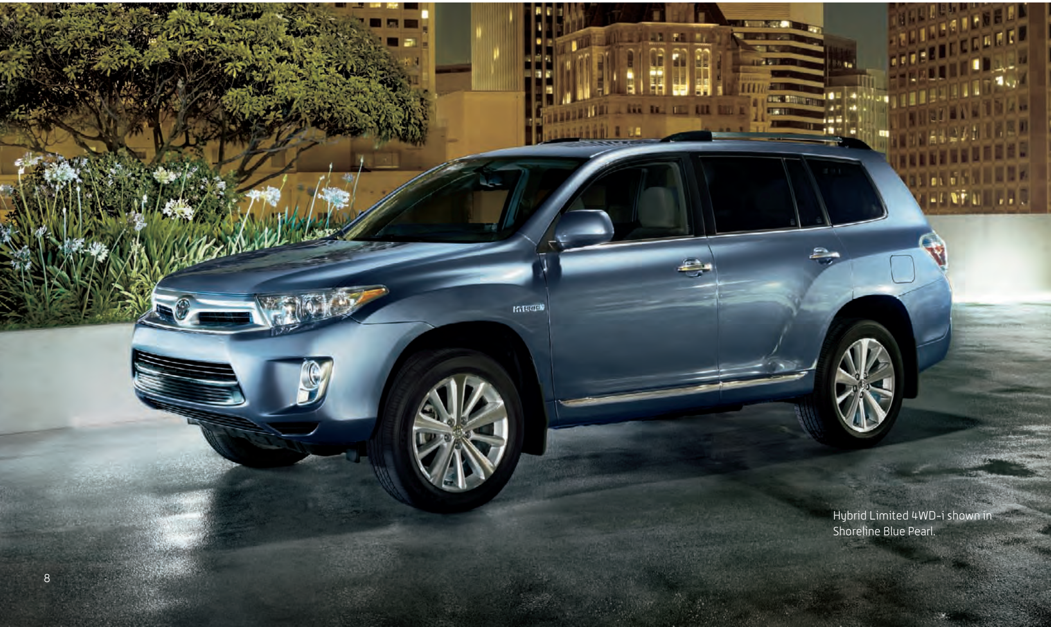
Hybrid Limited 4WD-i shown in Shoreline Blue Pearl.

you need it. And with a combined city/highway fuel efficiency rating of 6.9 L/100 km, 2 you can get anywhere you're going without worrying about the pumps.