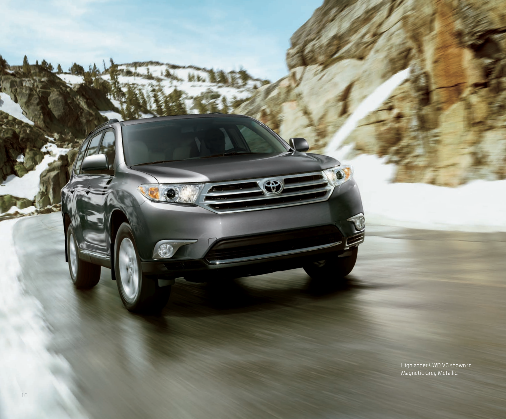
Highlander 4WD V6 shown in Magnetic Grey Metallic.