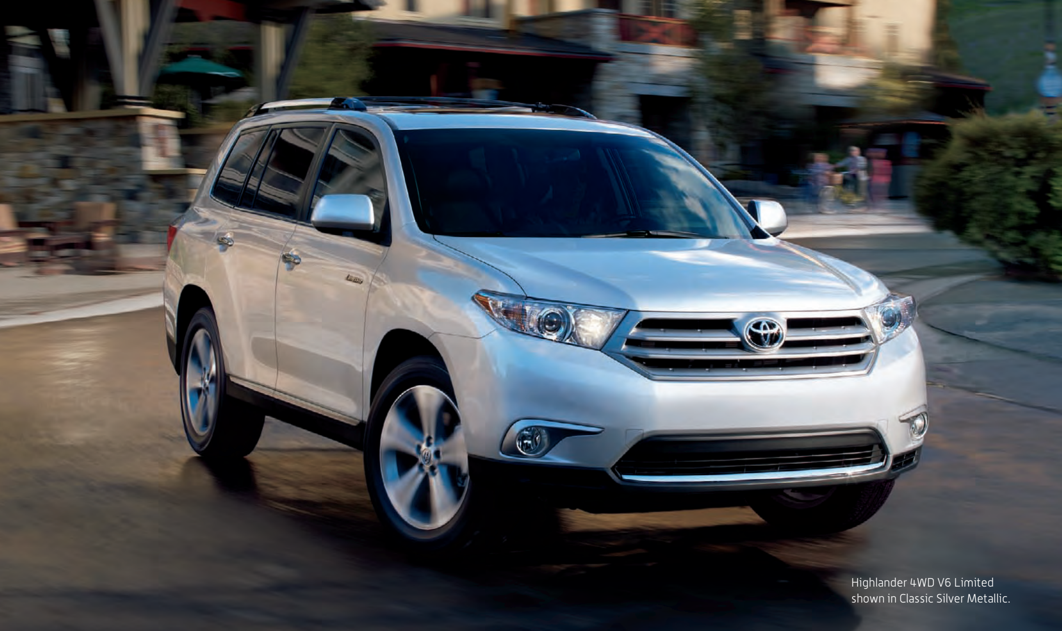
Highlander 4WD V6 Limited shown in Classic Silver Metallic.