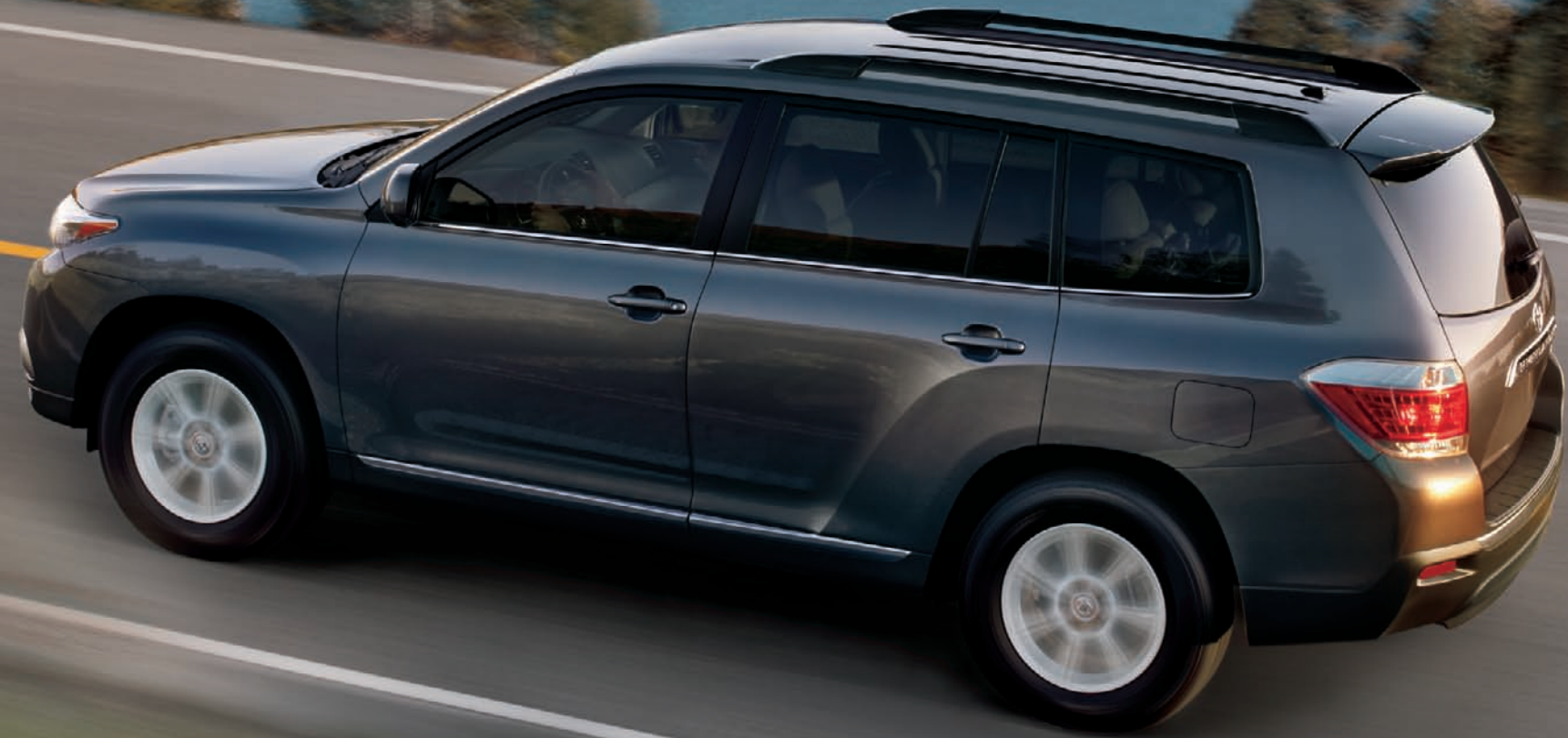
Highlander FWD 4-cylinder shown in Magnetic Grey Metallic.

even on long trips. And thanks to the innovative stadium seating, each row sits higher than the row ahead of it, enhancing each passenger's visibility and sense of space.