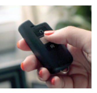
Toyota START+ Remote Engine Starter