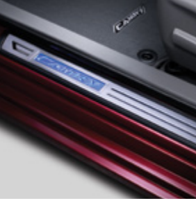
Illuminated Door Sill Protectors