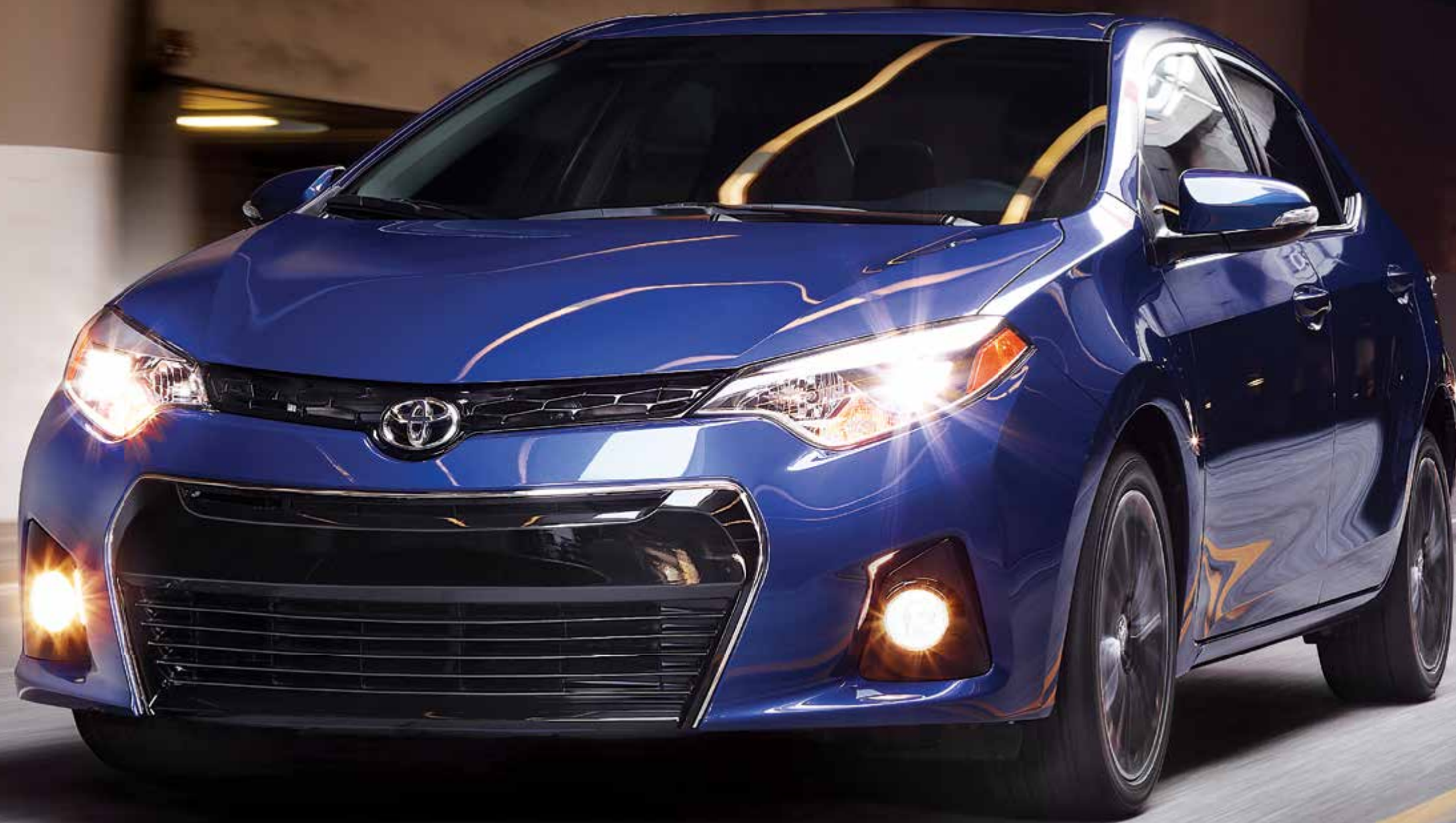
Corolla S with Upgrade Package shown in Blue Crush Metallic. LE ECO shown in Alpine White.

Make the most of life, one km at a time.