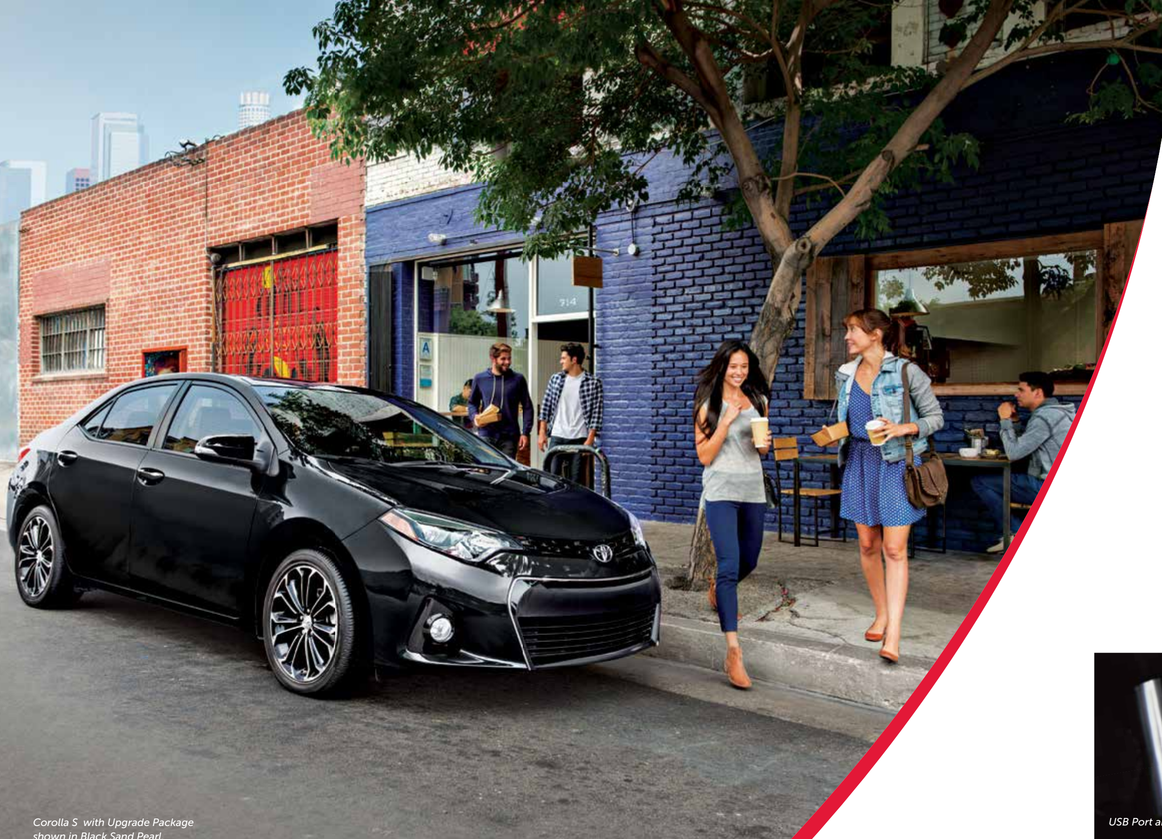
Corolla S with Upgrade Package shown in Black Sand Pearl.

Toyota's history of innovation has led to the most technologically advanced Corolla ever. The standard steering wheel controls are intelligently placed to let you access the audio system and hands-free Bluetooth ® wireless technology. The available 6.1-inch touch-screen Display Audio System 4 lets you conveniently stream your music wirelessly. The available Navigation System 5 includes a unique "text-to-speech" feature that converts phone texts into voice messages played through the vehicle's speakers. The result? A car that moves you forward in more ways than one.