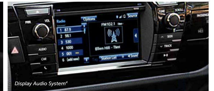
Display Audio System 4