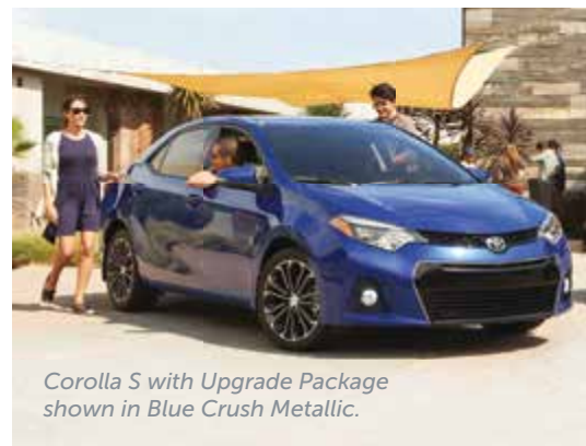
Corolla S with Upgrade Package shown in Blue Crush Metallic.