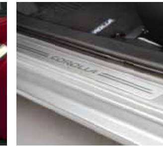
Door Sill Protector