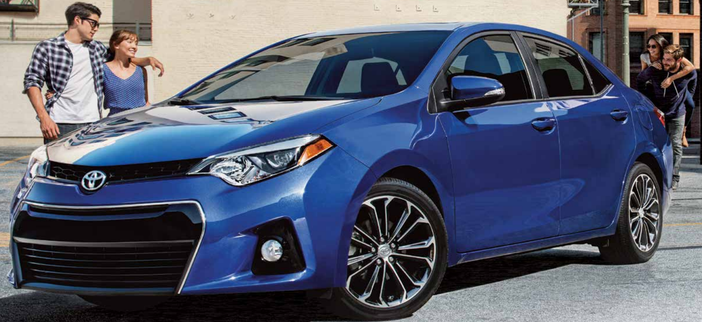
FRONT COVER/PAGE 2 Corolla S with Upgrade Package shown in Blue Crush Metallic.

Today, there's a Corolla waiting for you that goes far beyond all of your expectations. With all of the reliability, practicality and fuel economy that you might expect, and a level of style, comfort and performance that will definitely surprise you. The Corolla has been a favourite of Canadian drivers for decades, and that history is destined to repeat – because the 2016 Corolla is a car you can count on right now, and for all the tomorrows you have to look forward to.