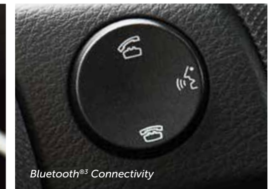
Bluetooth ® Connectivity