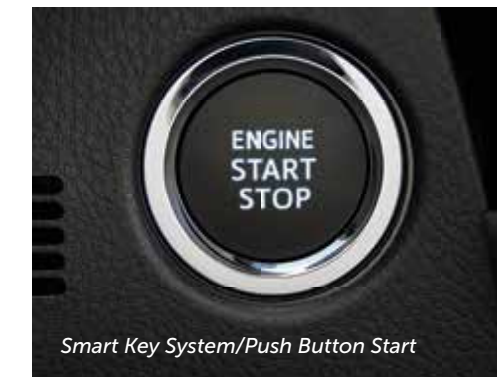
Smart Key System/ Push Button Start