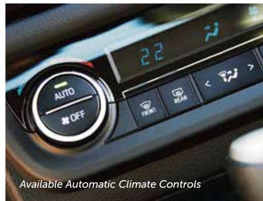
Available Automatic Climate Controls