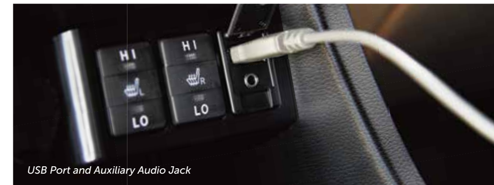
USB Port and Auxiliary Audio Jack