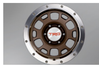
TRD 16" Off-Road Alloy Wheel