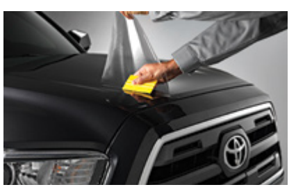
Paint Protection Film