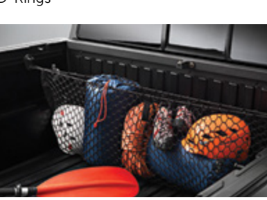
Cargo Net - Envelope