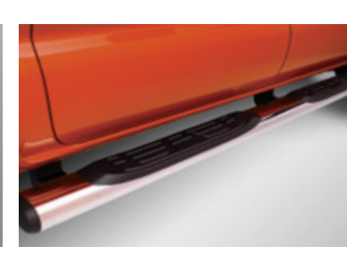
Side Step Bars - 5" Chrome