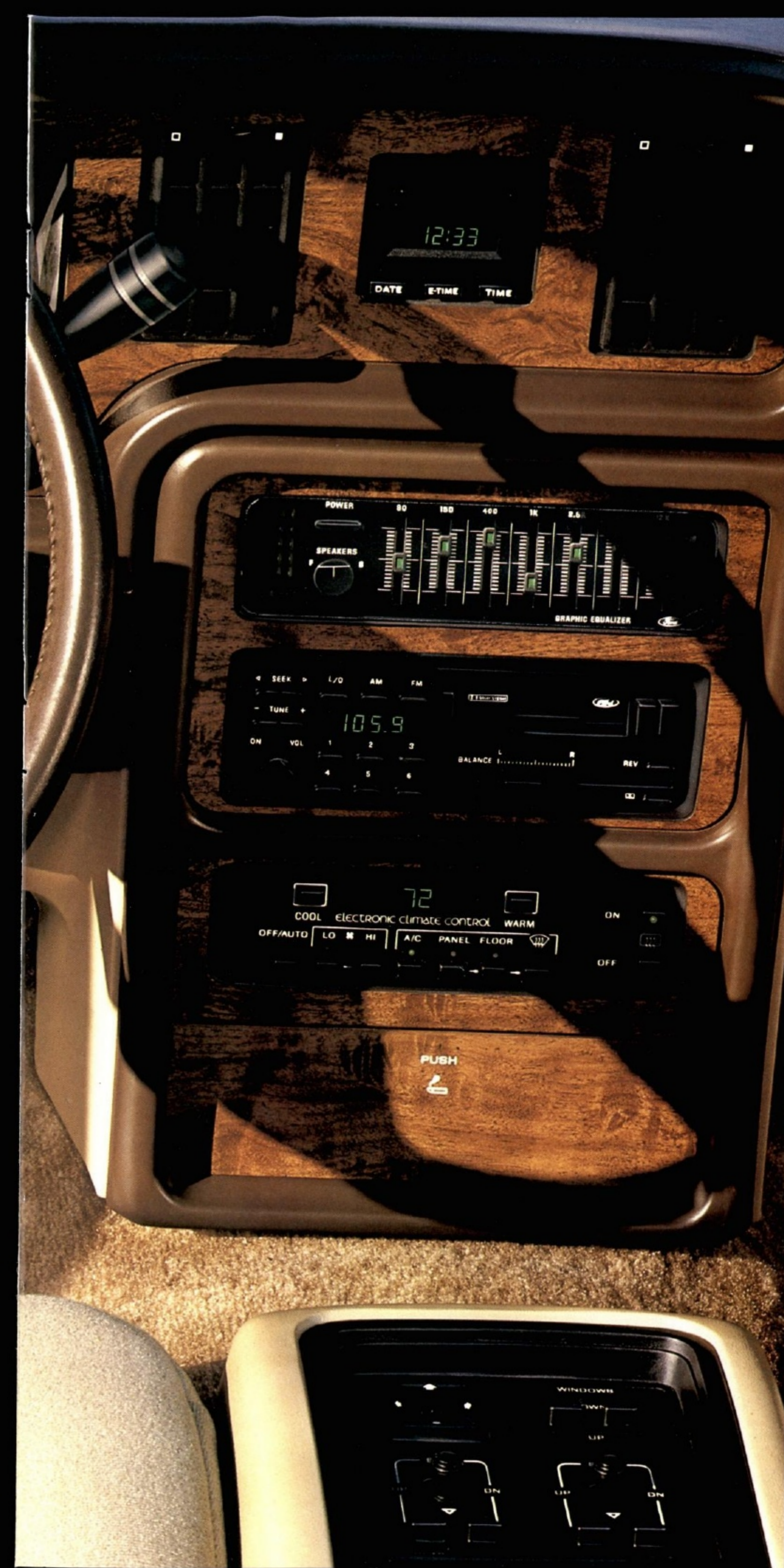
Cougar optional instrument panel in a Sand Beige LS interior. Some features shown may be optional. See option list on page 21.