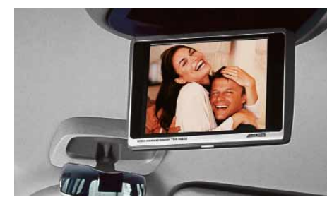
C8 Roof mounted video screen