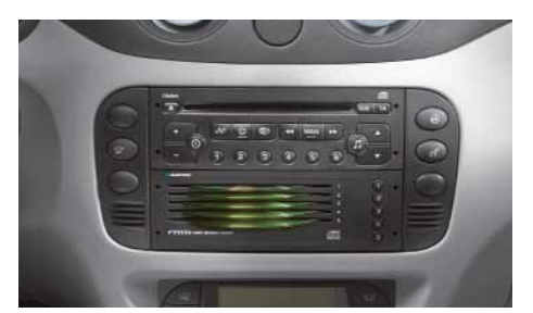
New C2/C3/C3 Pluriel 5 Disc CD Autochanger