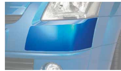
New C2/C3/C3 Pluriel Bumper Protection