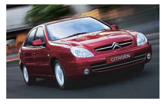
*The Manufacturer's 'On The Road' Recommended Retail Price includes the following: Delivery to Dealer and Number Plates £446.81, VAT £78.19, Government First Registration Fee £38 and Graduated Vehicle Excise Duty (see page 15 for details).

(Models produced from 1st November 2003)