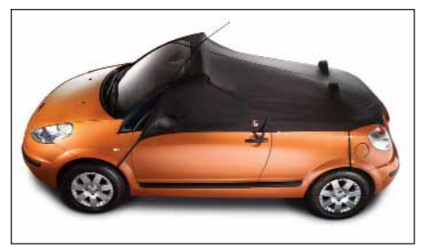
C3 Pluriel Rain Cover