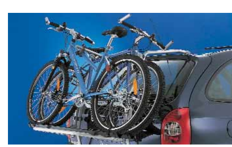
Xsara Picasso Tailgate Bike Carrier