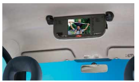
Xsara Picasso Overhead Screen