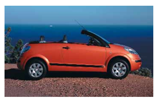
*The Manufacturer's 'On The Road' Recommended Retail Price includes the following: Delivery to Dealer and Number Plates £446.81, VAT £78.19, Government First Registration Fee £38 and Graduated Vehicle Excise Duty (see page 15 for details).