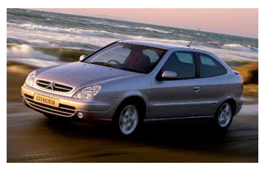
*The Manufacturer's 'On The Road' Recommended Retail Price includes the following: Delivery to Dealer and Number Plates £446.81, VAT £78.19, Government First Registration Fee £38 and Graduated Vehicle Excise Duty (see page 15 for details).