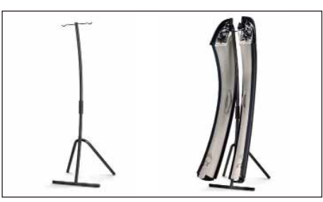
C3 Pluriel Roof Arch Storage Stand