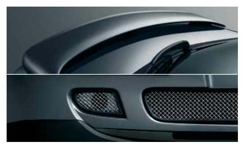
C5 VTR Sports pack