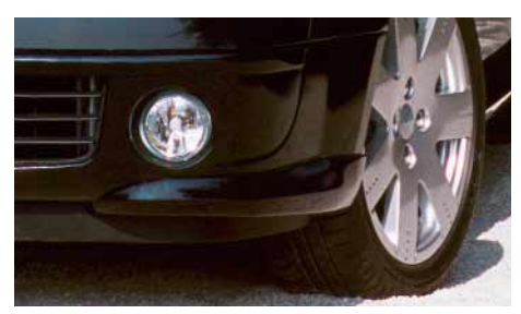
New C2 Front Fog Light Kit