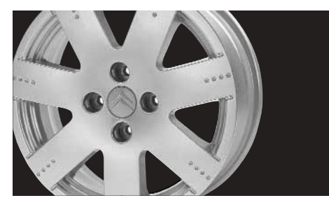
New C2/C3/C3 Pluriel 16" Leopard Alloy Wheels