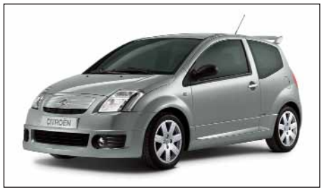
New C2 Bodystyling Kit