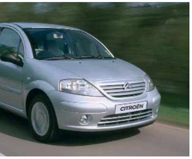
*The Manufacturer's 'On The Road' Recommended Retail Price includes the following: Delivery to Dealer and Number Plates £446.81, VAT £78.19, Government First Registration Fee £38 and Graduated Vehicle Excise Duty (see page 15 for details).

<sup>5</sup> Standard on 1.4 HDi 70 Furio SensoDrive Euro 4 only.