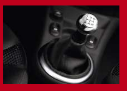
worthy of competition!