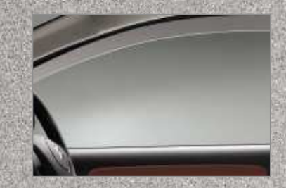
The front electric windows<sup>†</sup> with one touch (driver side) and nonsequential (passenger side) operation are fitted with an antipinch system.