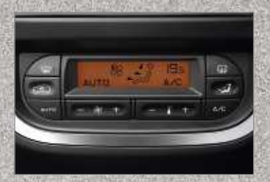
The Citroën C2's sophisticated automatic air conditioning system<sup>†</sup> simultaneously adjusts the flow of air, its distribution together with temperature to maintain passenger comfort.