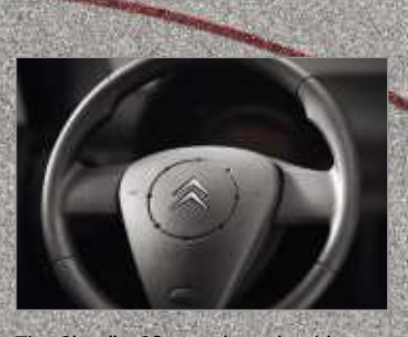
The Citroën C2 steering wheel is both height and reach adjustable for the ideal grip and optimum driving position. In addition all models feature variable power assisted steering.