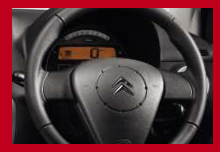
With its height and reach adjustable leather steering wheel, C2 VTS offers you the steering allows you to manoeuvre with ease