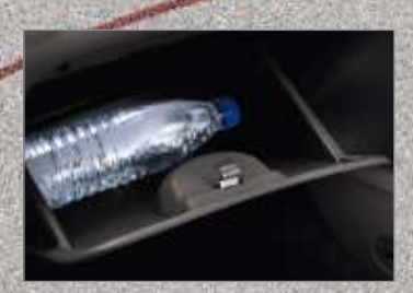
The lockable glove box has 7 litres of storage space at your disposal.