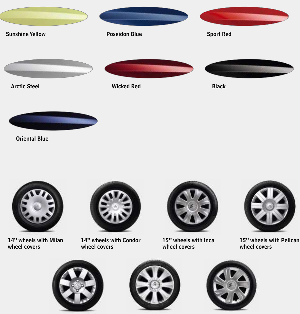
Coyote 15" alloy wheels with low profile tyres

The range of Citroën C2 colours comprises a palette of 7 colours that have been carefully selected to harmonise with the interior trim.