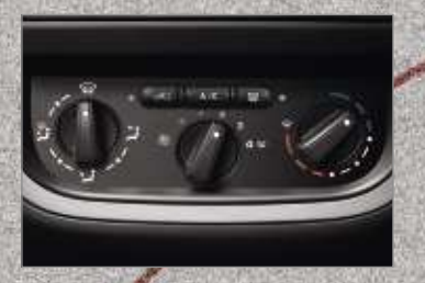
The manual air conditioning system<sup>†</sup> can deliver an ideal temperature in any season, even in the height of summer.