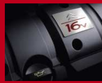
1.6 litres, 16 valves, 125hp... C2 VTS' engine is the perfect expression of the car's