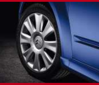
Aesthetics counts as much as performance – tyres complete the C2 VTS' sporty look and