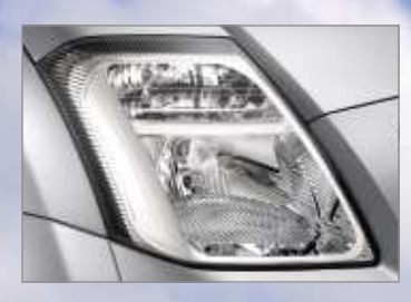
The lines and transparency of the generous headlamps convey the Citroën C2's distinctive character.