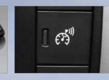
A clever control<sup>†</sup> located on the central console enables you to register a maximum speed. In the event of exceeding this preprogrammed limit, an audible warning will alert you.