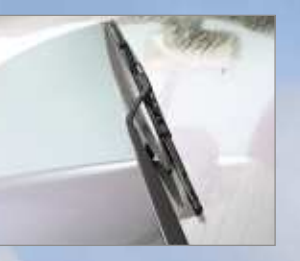
Rain sensors<sup>†</sup> automatically trigger the wipers at the first drop of rain.

ABS with Electronic Brakeforce Distribution (EBD) and Emergency Braking Assistance (EBA) comes as standard on all versions. EBD controls brake pressure individually for each wheel, while EBA reduces stopping distances under emergency braking.