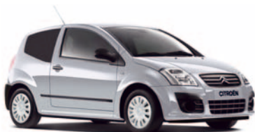
C2 Enterprise page 3