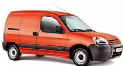
Berlingo & Berlingo First page 5