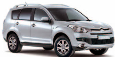
New C-Crosser Enterprise page 14