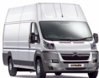
Relay page 10