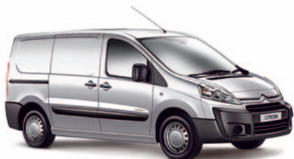
Dispatch page 8