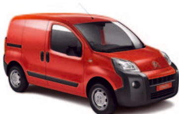
New Nemo page 4