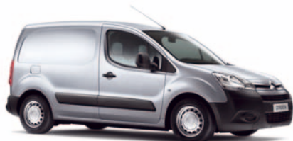
New Berlingo page 6