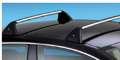
Roof bars £201.48