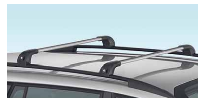
Roof bars** £148.00