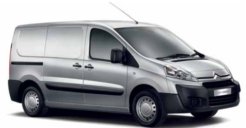
> CITROËN DISPATCH Page 6