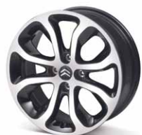
17" 'Clover' alloy wheels (set of four) £897.98