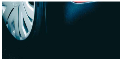
Front & rear mudflaps £37.00