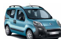
> CITROËN NEMO MULTISPACE Page 6