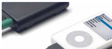
MP3 adaptor* £186.00