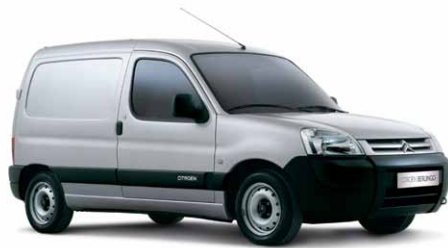
> CITROËN BERLINGO FIRST Page 4