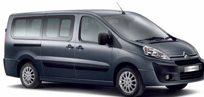
> CITROËN DISPATCH COMBI Page 9