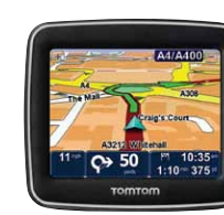
TomTom Start UK & ROI £99.98