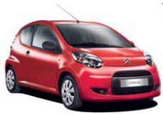
> CITROËN C1 Page 3