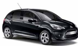
> NEW CITROËN C3 Page 4