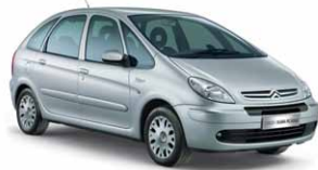
> CITROËN XSARA PICASSO Page 9