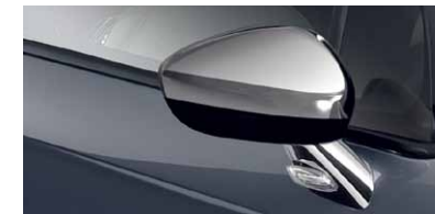
Chrome wing mirror covers £53.00