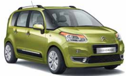
> CITROËN C3 PICASSO Page 8