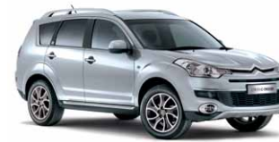
> CITROËN C-CROSSER Page 16