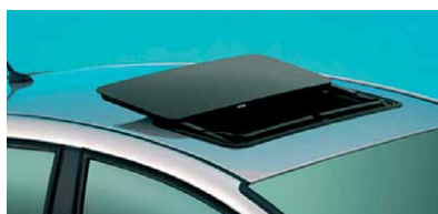
Electric tilt slide sunroof £683.00