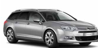
> CITROËN C5 TOURER Page 15