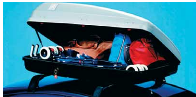
Roof box – short, 280 L capacity £226.00