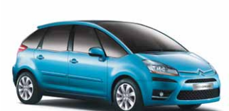
> CITROËN C4 PICASSO Page 12