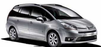
> CITROËN GRAND C4 PICASSO Page 13