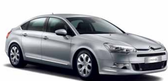
> CITROËN C5 SALOON Page 14