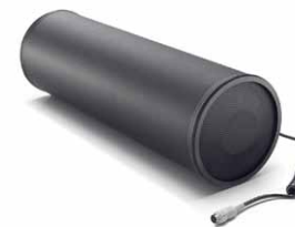
Hi-Fi module £270.00