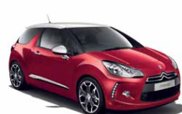
> NEW CITROËN DS3 Page 5