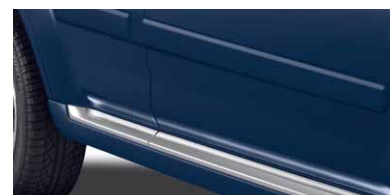
Side protection mouldings £110.10