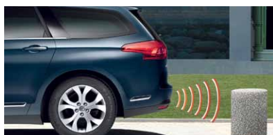
Rear parking sensor kit £152.00