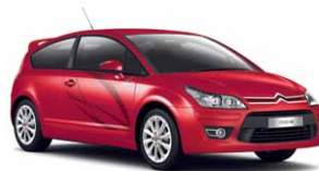
> CITROËN C4 COUPÉ Page 10