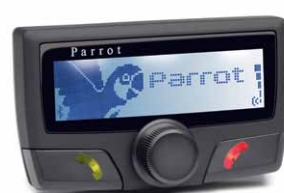
Bluetooth® hands-free car kit £159.00