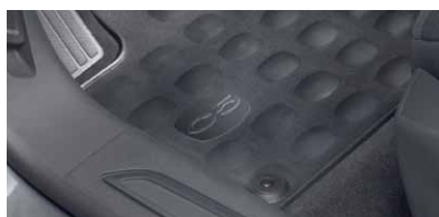
Rubber mat set £46.00