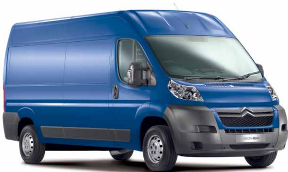
> CITROËN RELAY Pages 7-8