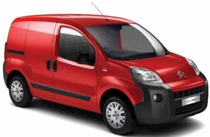
> CITROËN NEMO Page 3