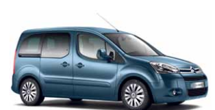
> CITROËN BERLINGO MULTISPACE Page 7