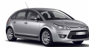
> CITROËN C4 HATCHBACK Page 11