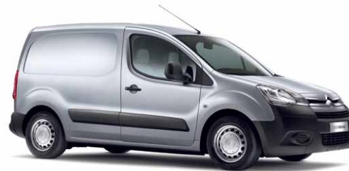
> CITROËN BERLINGO Page 5