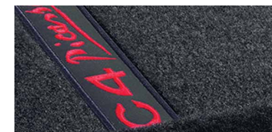
Carpet set £56.00