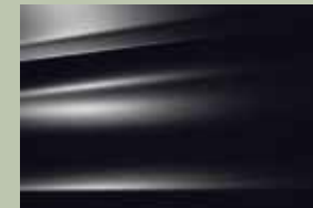
Obsidian Black (pearlescent)