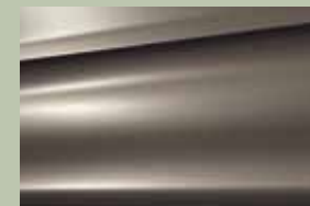
Mativoire Beige (metallic)