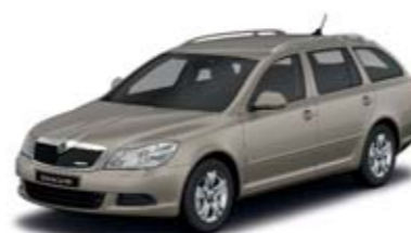
21. Cappuccino Beige metallic