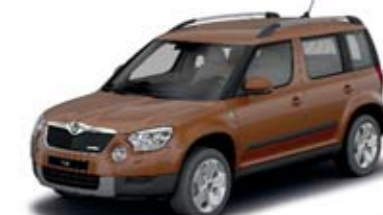
8. Terracotta Orange metallic