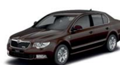
14. Magnetic Brown metallic