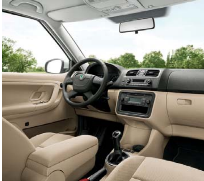
Fabia/Fabia Combi/Roomster GreenLine and Green tec