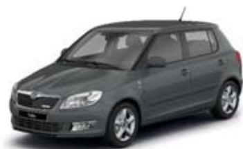
17. Anthracite Grey metallic