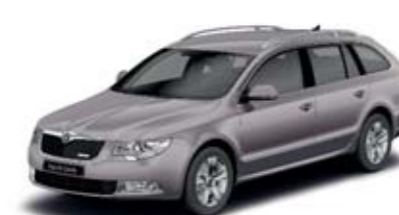
7. Amethyst Purple metallic