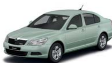
4. Arctic Green metallic