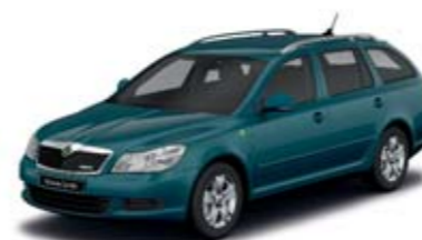
13. Lava Blue metallic