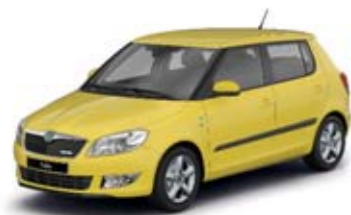
1. Sprint Yellow special