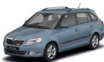
18. Satin Grey metallic