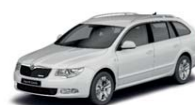
15. Candy White uni