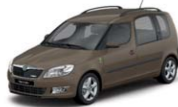
11. Mato Brown metallic