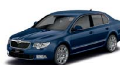
22. Storm Blue metallic*