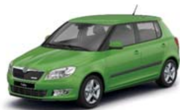
9. Rallye Green metallic