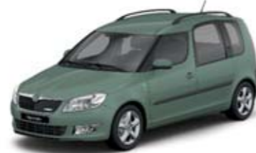
19. Malachite Green metallic