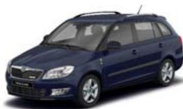
2. Pacific Blue uni