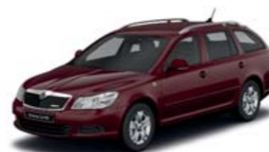
5. Rosso Brunello metallic