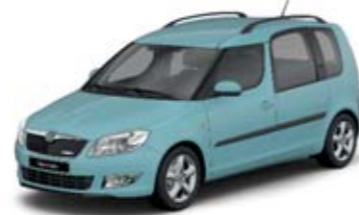
3. Miami Blue metallic