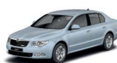
6. Aqua Blue metallic