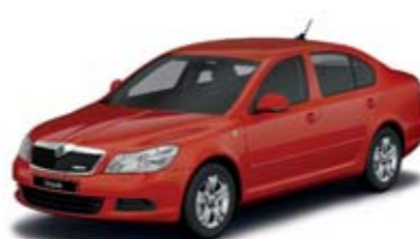
20. Corrida Red uni