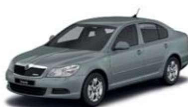
12. Platin Grey metallic