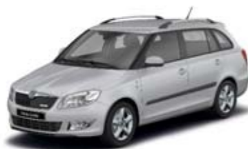
10. Brilliant Silver metallic