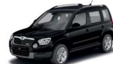
16. Black Magic pearl effect