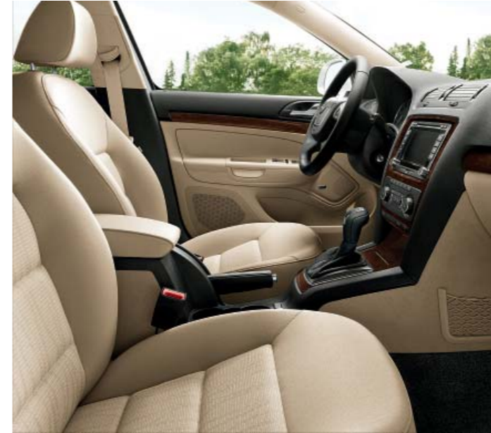
Octavia/Octavia Combi GreenLine and Green tec

Domino interior in black or grey with Onyx-Onyx or Onyx-Silvergrey dashboard