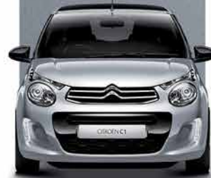
Gallium Grey (M)