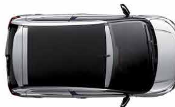
Black fabric roof

15 inch Black 'Planet' alloy wheels Automatic Pack – Automatic air conditioning, automatic headlights, electrically heated and adjustable door mirrors Reversing camera Grey fabric roof Metallic paint Flat paint