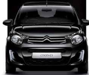
Caldera Black (M)