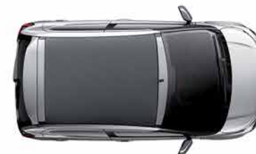
Grey fabric roof 2