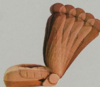
RECLINING SEATBACKS help you select the perfect driving position for you, while your passenger may select the comfort of any position, including fully reclined for napping.