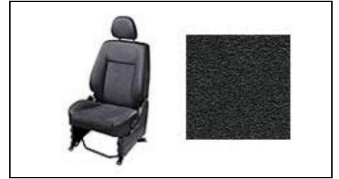
Leather and Alcantara