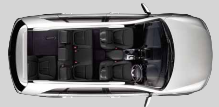
Partial third row folding

Sorento KX-2, KX-3 and KX-3 Sat Nav models come with leather seats and the convenience of steering wheel mounted controls for audio and cruise control. In addition, all KX-3 models feature an electrically adjustable driver's seat with lumbar support.