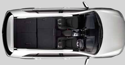
Second row & third row folding