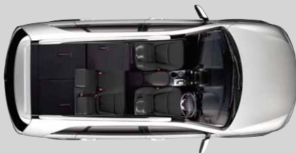
Partial second row & third row folding