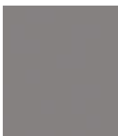
Aluminium Silver Metallic