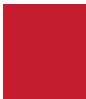
Velocity Red Mica