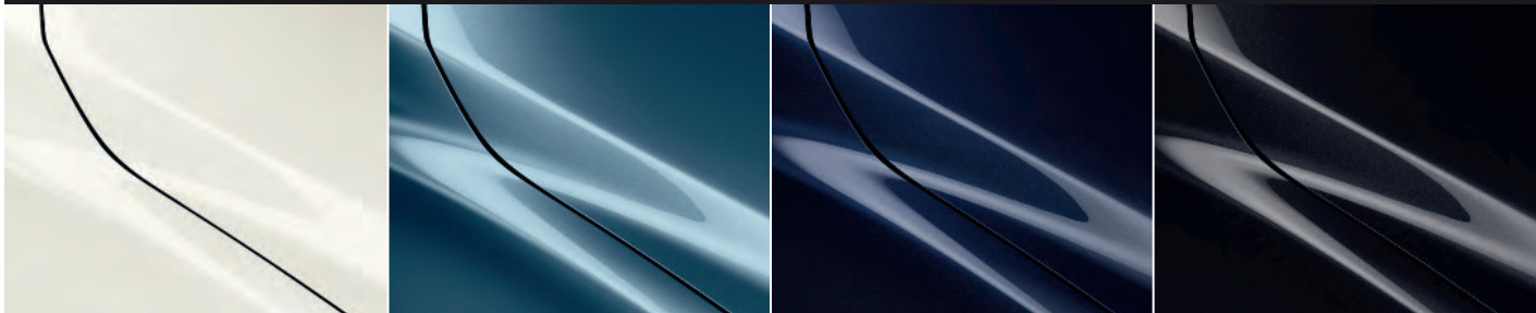
ARCTIC WHITE SOLID