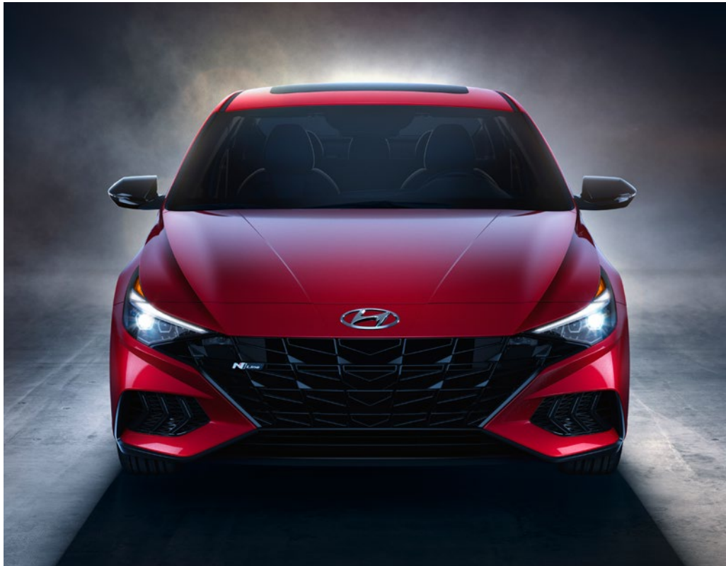
Available N Line front fascia and glossy black grille with emblem Available LED headlights

From every angle the ELANTRA delivers a sporty and striking look. Bold, converging character lines create a unique three-dimensional presence along the side. A dominant bold grille up front seamlessly integrates into the headlight architecture and the sleek-edged trunk lid further adds to the confident appearance.