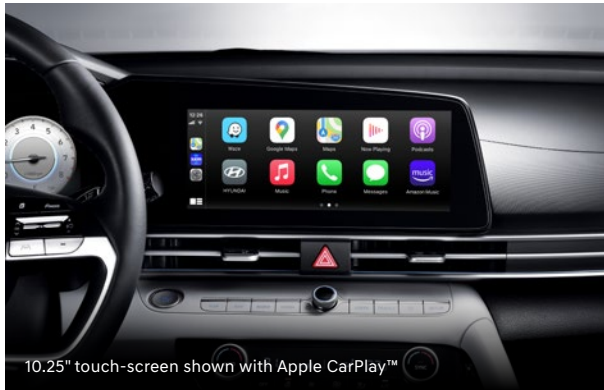
10.25" touch-screen shown with Apple CarPlay™

The features offered in the ELANTRA are nothing short of impressive. When you step inside — using the available proximity key, of course — you are greeted by an available sleek digital instrument cluster, flowing into the available 10.25" touch-screen display with navigation. Add in the available wireless charging pad ▼ and the available Bose ® sound system and you'll know what we mean by “transform your drive.”