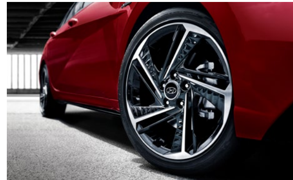
Available 18" alloy wheels