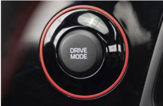
Drive Mode Select At the press of a button find your preferred powertrain, steering and stability control settings. Choose from three different modes: Normal , Sport and Smart .