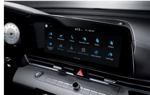
Available 10.25" touch-screen with wired Apple CarPlay™ ▲ and Android Auto™ ▲ , and navigation system