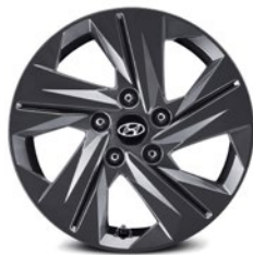
16" alloy wheel Standard on Preferred model