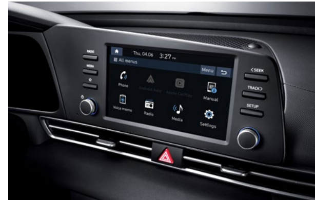
Standard 8.0" touch-screen display