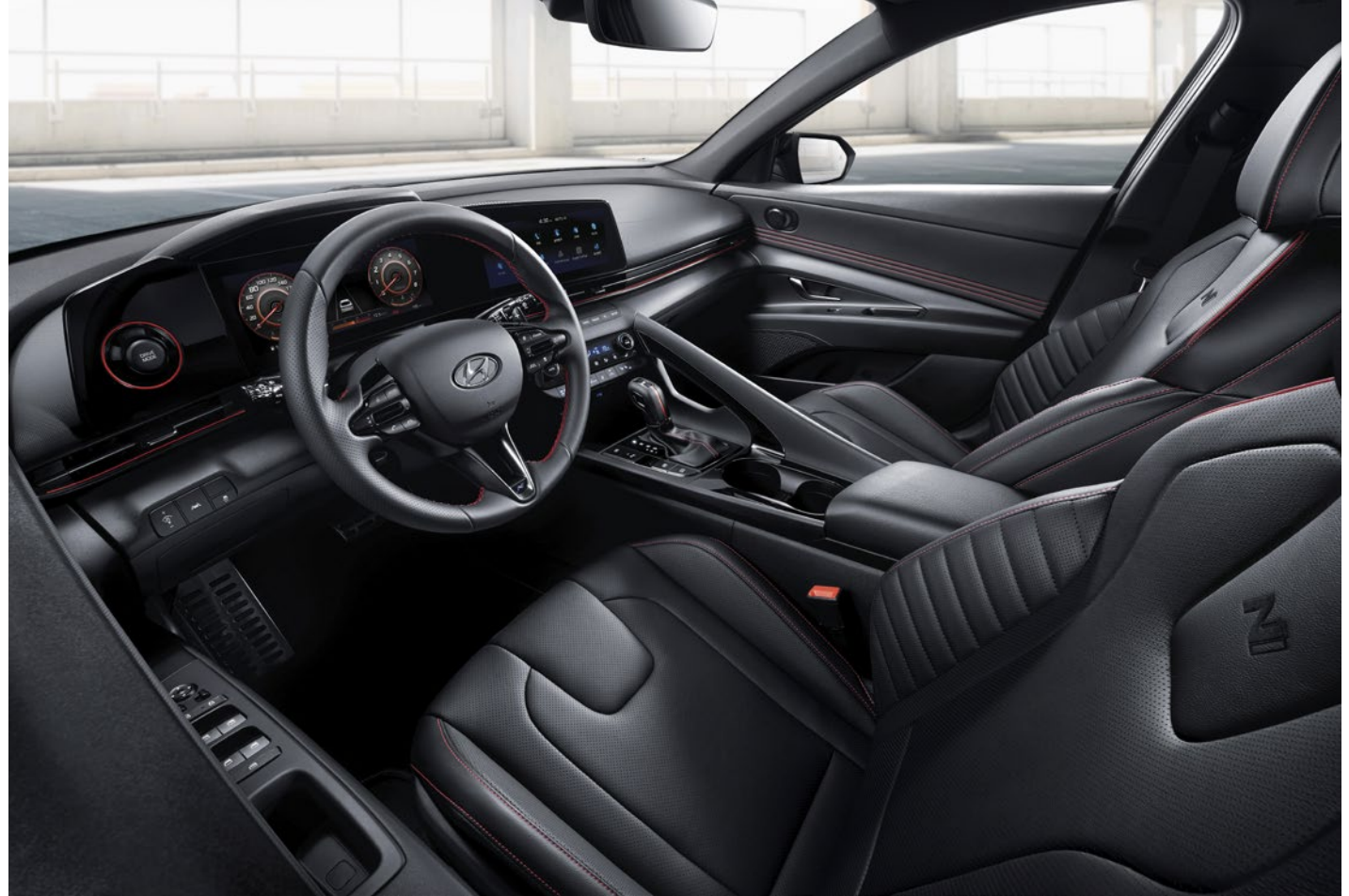
N Line model shown. May not be exactly as shown.

A number of available features are customizable to your liking, including the 8-way power driver's seat, the interior ambient lighting with 64 colour choices and the dual-zone automatic climate control. You can even adjust the depth of the cup holders to better fit your favourite coffee cup or extra-tall water bottle.