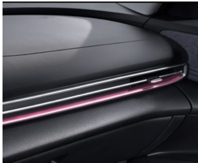
Available interior ambient lighting (64 colour choices)