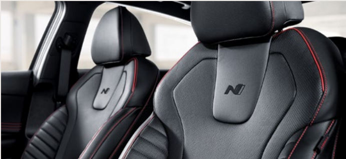
N Line sport leather seats Embossed with an “N” logo, the leather sport seats are lined with red contrast stitching and piping.