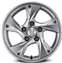
15" alloy wheel Standard on Essential model