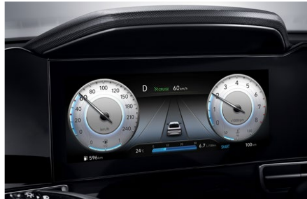
Available 10.25" full digital instrument cluster

Standard Apple CarPlay™ ▲ and Android Auto™ ▲ with available wireless connectivity