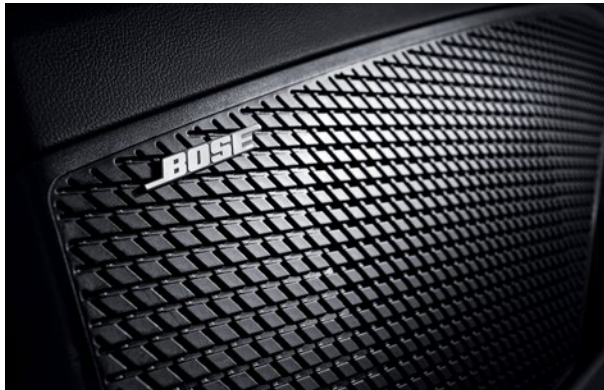
Available Bose ® premium sound system