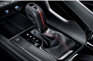
N 7-speed Dual Clutch Transmission (N DCT) The N DCT is an automated manual transmission with two separate clutches for increased efficiency, faster shifting and driving convenience.