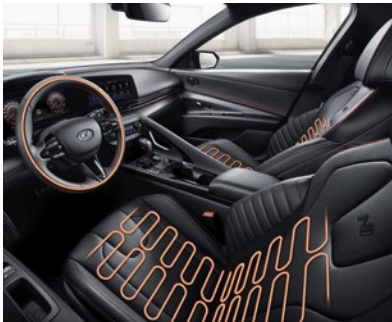
Standard heated front seats and available heated steering wheel