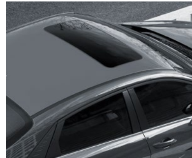
Available power sunroof