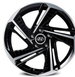
18" alloy wheel Standard on N Line model