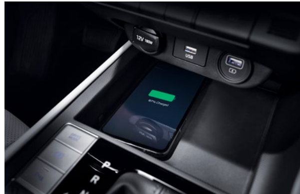
Available wireless charging pad ▼