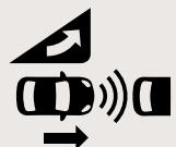
Forward Collision-Avoidance Assist with Pedestrian, Cyclist and Junction-Turning Detection