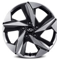
17" alloy wheel Standard on Luxury model