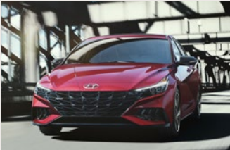
Sport-tuned suspension and steering The sport-tuned suspension with multi-link rear independent suspension is designed to give you a more dynamic drive and even sportier performance — making it perfect for those tight corners.