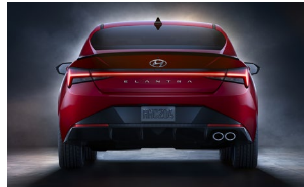
Available LED tail lights