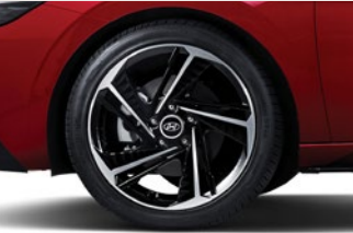
Larger disc brakes The N Line model is equipped with larger disc brakes for better braking performance, tuned for even more responsive and precise handling capabilities.