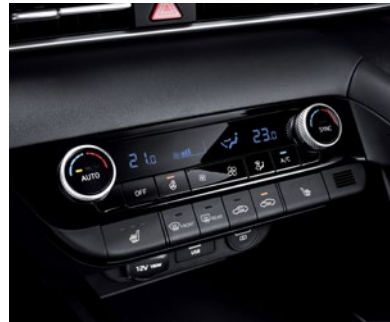
Available dual-zone automatic climate control