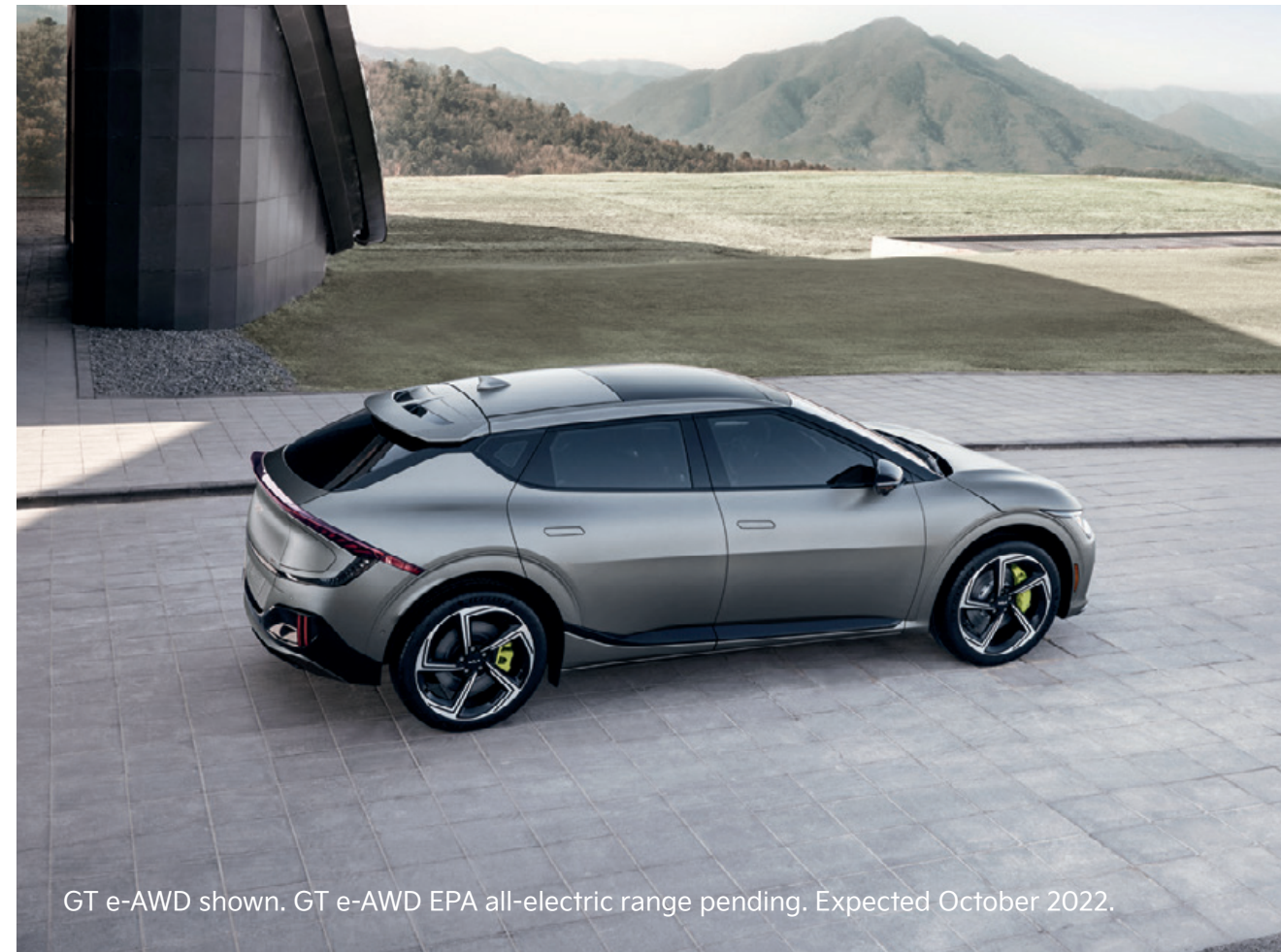
GT e-AWD shown. GT e-AWD EPA all-electric range pending. Expected October 2022.

310-mile All-electric Range 3 (Wind, GT-Line RWD)