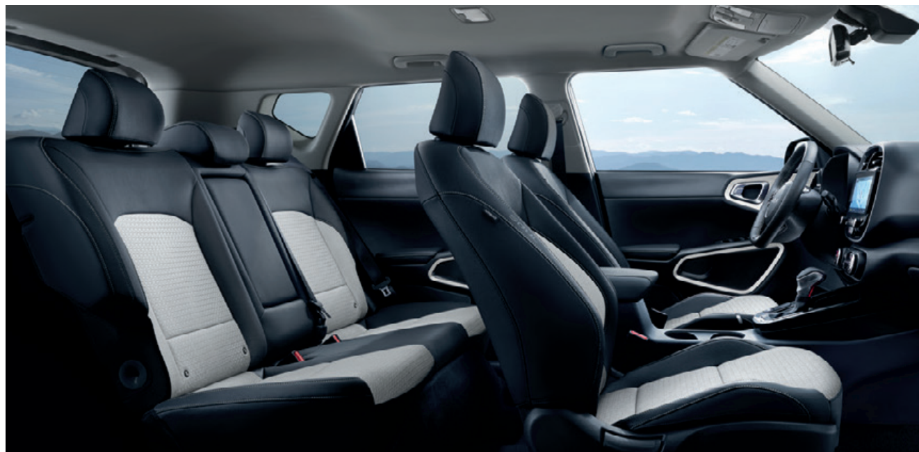
Heated Front Seats 12*